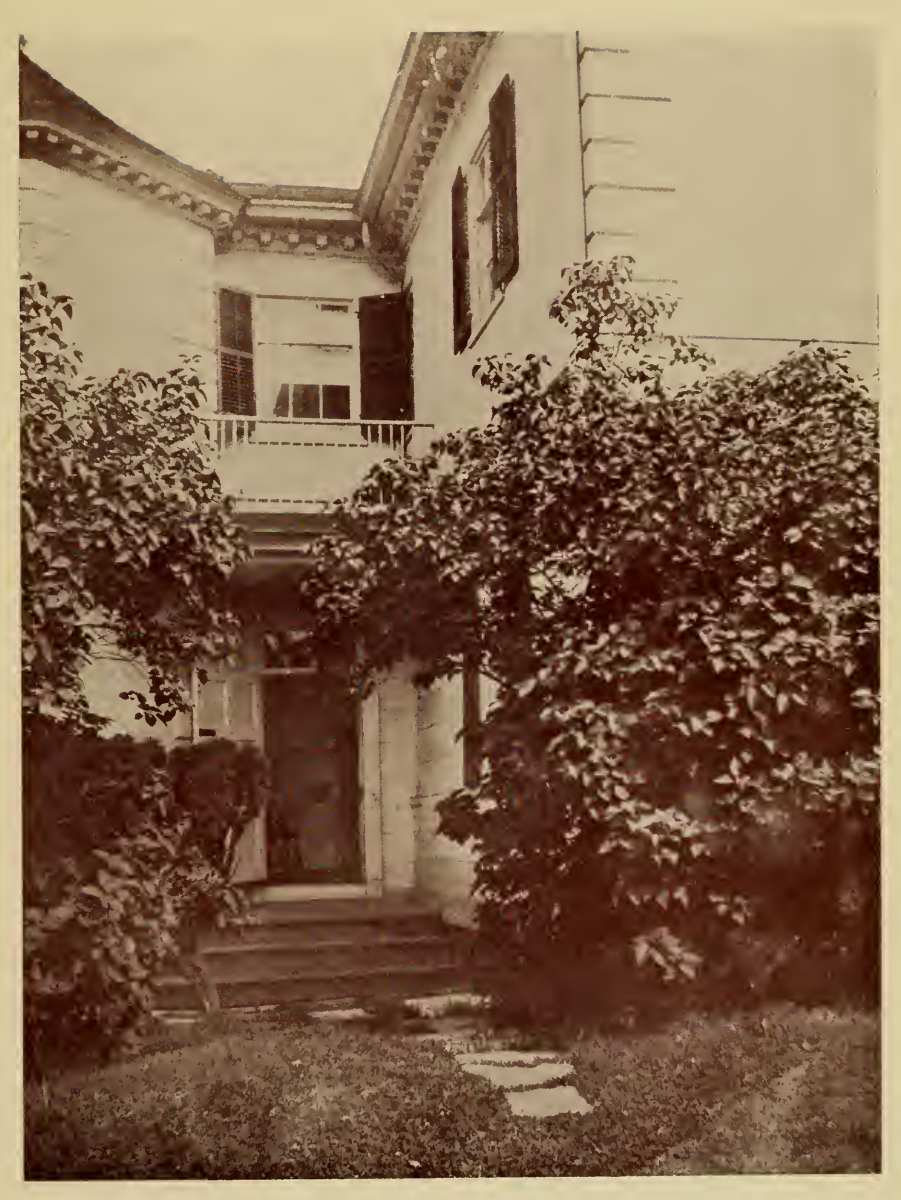
WEST SIDE OF MANSION SHOWING BALCONY USED AS SENTRY-BOX, AND DOORWAY THROUGH WHICH THE INDIAN BRAVES ENTERED WHEN PAYING HOMAGE TO WASHINGTON.