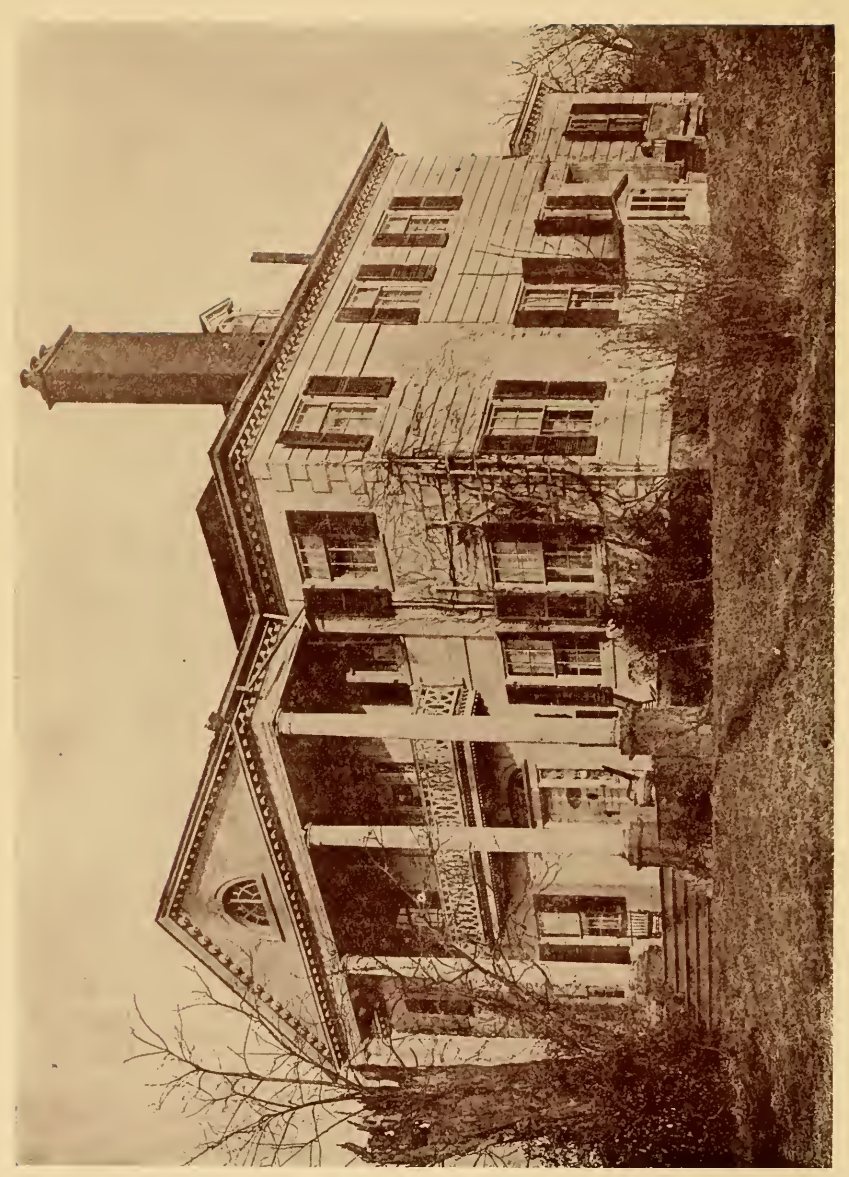
THIS HISTORIC MANSION IS IN THE CUSTODY OF THE WASHINGTON HEADQUARTERS ASSOCIATION, NEW YORK, FOUNDED BY DAUGHTERS OF THE AMERICAN REVOLUTION,