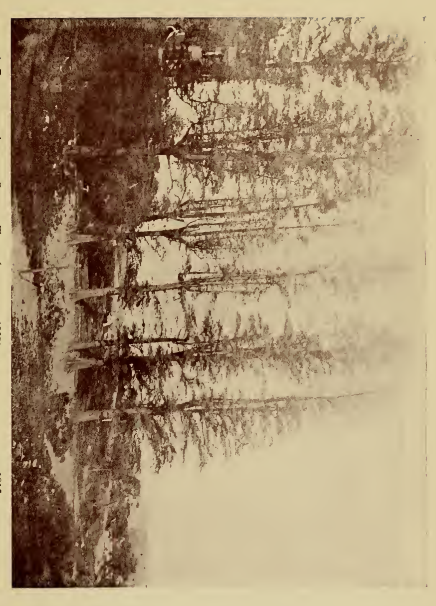
A Few of the African Cypress Trees (cut down 1909) imported and planted 1815, about the JUMEL FISH-POND, NOW 159th STREET, BETWEEN ST. NICHOLAS AND EDGECOMBE AVENUES.