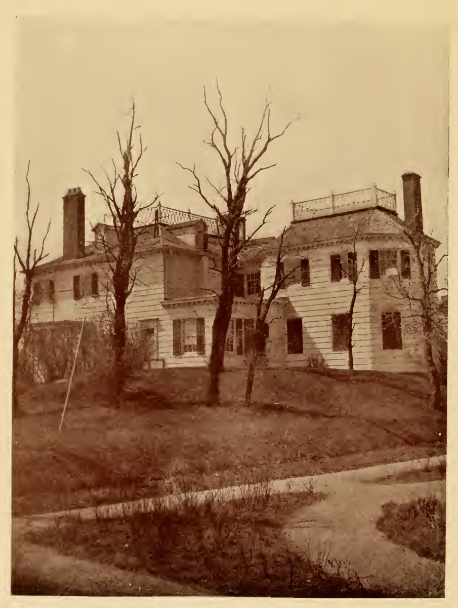
East side and rear of Mansion, showing Colonial Railings and also Rose Garden.