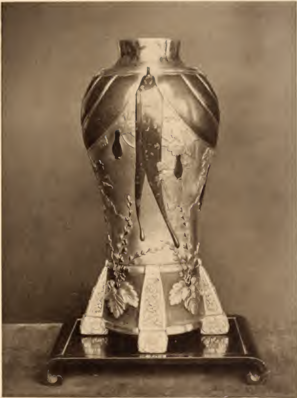
NO. 63. SUPERB SILVER VASE BY TIFFANY & CO.