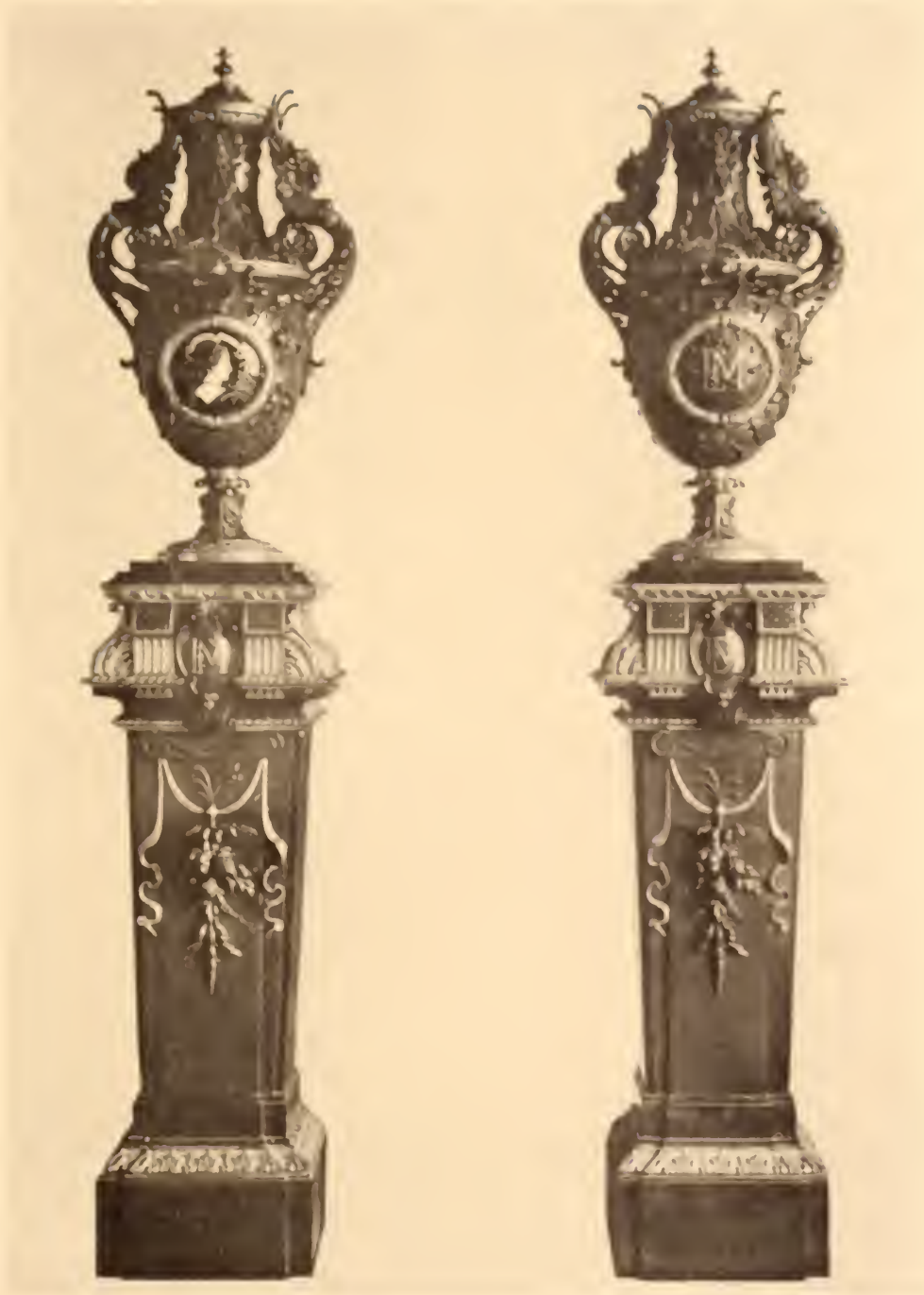
No. 64. PAIR GRAND VASES AND PEDESTALS