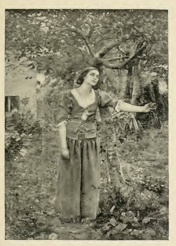
JEANNE D'ARC .- BASTIEN LE PAGE.