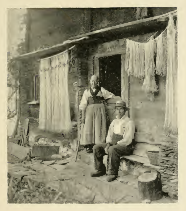
THEIR GOLDEN WEDDING.