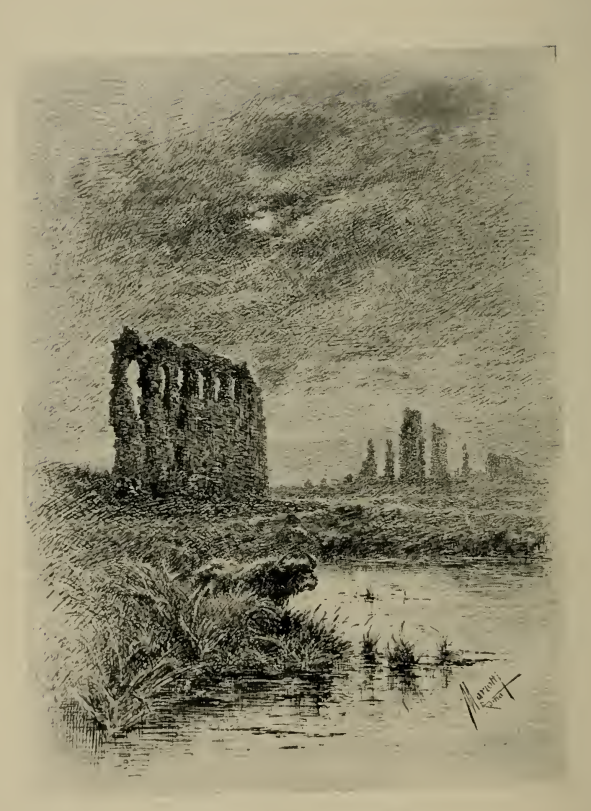
THE CAMPAGNA - ROME.