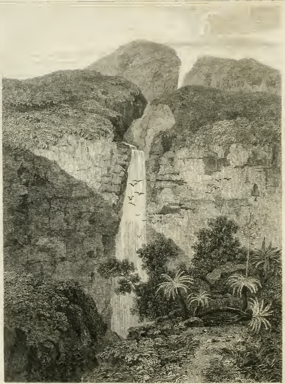
View of the River ...