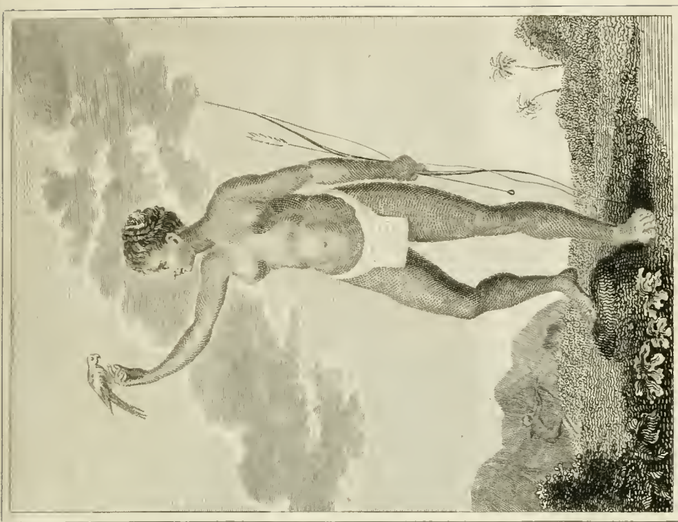
Indian 'Emale' of the 'Arumaka' Nation!

Printed and Published by G. S. & Co. No. 10, South Street, New York.