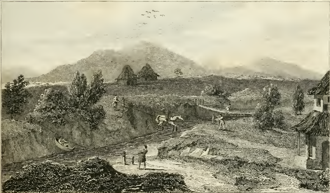
Uncommon Bridges in South America.