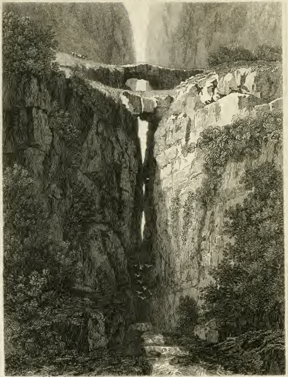
Natural Bridge of Tennessee.