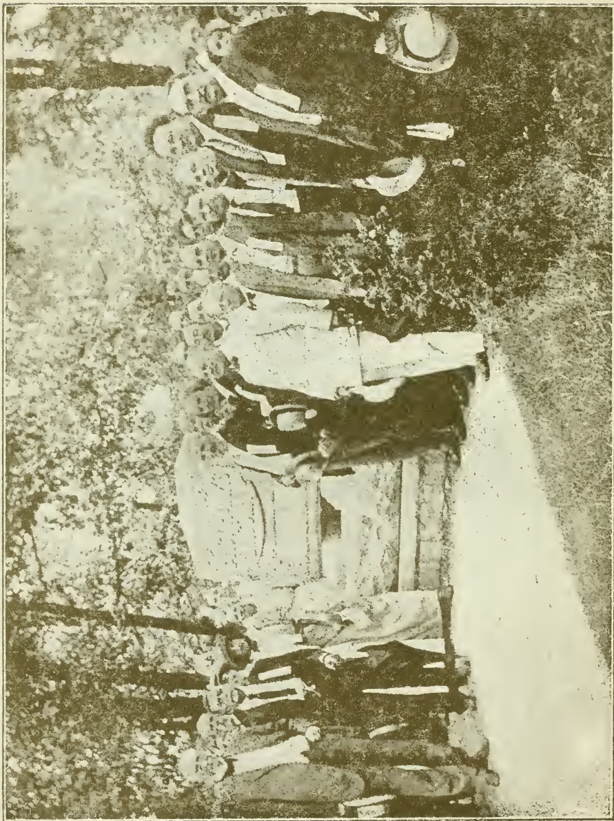
GROUP OF NOTABLE MEN AND WOMEN AT THE GRAVE OF NANCY HANKS LINCOLN