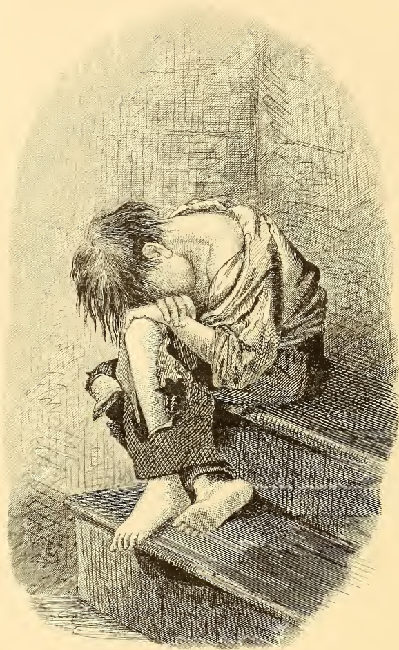
THE HOMELESS BOY.