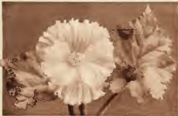
Beautifully notched and frilled Begonia Crispa

No. 21 double Fimbriata in 5 beautiful colors, separately packed, for only $ 8.60. 50 for $ 8.60