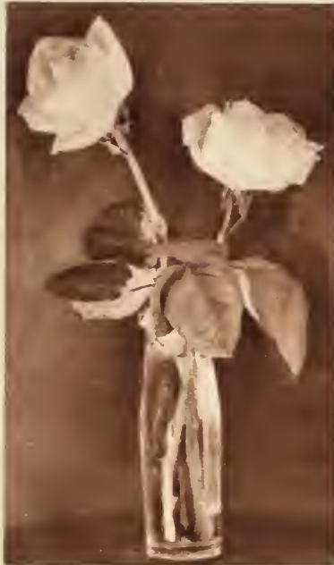
Elegant flower-piece of 2 Roses only