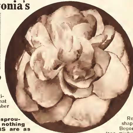
Rose shaped Begonia (see mixture)

Besides an enormous variation of colors and shades this rainbow mixture has also a very great diversity of shapes. Not only the ordinary trade varieties but also a great many so called deviations are to be found in it, which, as yet, have not been classified — such as: very capriciously scalloped and very fantastically notched petals; Rose-shaped, Aster-shaped and Zinnia-shaped Begonia's and many more peculiar deviations. And amongst these we put in a number of remnants of Begonia's, so that a really magnificent mixture is obtained, in regard to colours and shapes. The quality of this mixture is excellent, moreover we supply this mixture bargain cheap, so a special opportunity is offered to obtain a luxuriance of flowers at small expense. Cheap rainbow mixture gigantic-flowered. Begonia's, per 12 $ 1.60; per 100 $ 10.80. 25 for $ 2.90