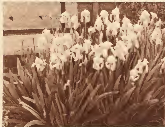
Very fine group of iris Germanica

No. 40 In all: 15 Helianthus in 3 varieties, separately packed for $ 2.40 15 for $ 2.40