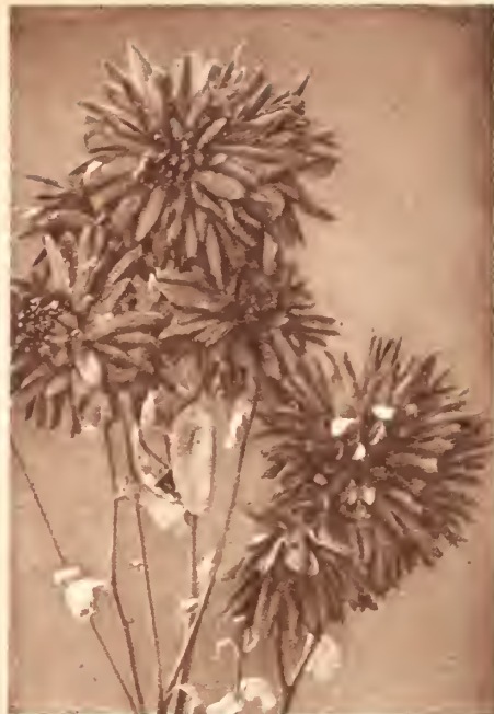
Rarely beautiful hardy Chrys. „Beaumont“

Cheap rainbow mixture hardy Chrysanthemums. In this mixture appear very many varieties, with a choice of all possible color-variations. To mention only some of them: white, pink, yellow, gold-brown, leather-brown, bronze, brown-red, wine-red, purple and salmon-colored shades, with all possible half shades in between. For groups, borders and beds they are strongly recommended. Late in autumn, when all other flowers have withered, and the trees are leafless and your whole garden would look sombre and forlorn, these plants still provide you, for very little money, with a gaily colored flower garden, from which you can daily cut new and fresh flowers for your home. Very heavy quality, which will produce a mass of flowers, at subjoined low prices. Rainbow mixture hardy Chrysanthemums per 3 $ 0.60; per 12 $ 2.10; per 25 $ 3.70 12 for $ 2.10