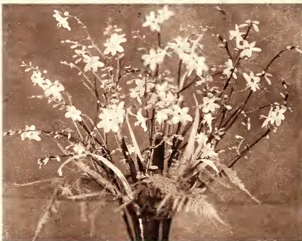
Each branch of these Montbretia's is closely studded with buds and lovely chalice-shaped flowers

BARGAIN-PRICED MONTBRETIA MIXTURE TO GROW WILD. These Montbretia's grow and flower anywhere, wherever they are planted, even on the poorest sandy or heathy soil. This makes them so remarkably suitable to fill nooks and corners, for which the superior varieties are too expensive, with their splendour of flowers and in this way to give the whole garden a gay and sunny appearance. Very good quality at the following extremely low prices : per 12 $ —.75; per 25 $ 1.30; per 100 $ 4.70. 25 for $ 1.30