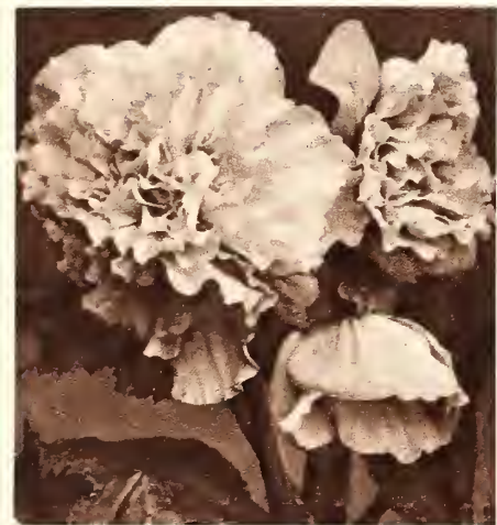
Plant of a heavy double gigantic-flowered Begonia