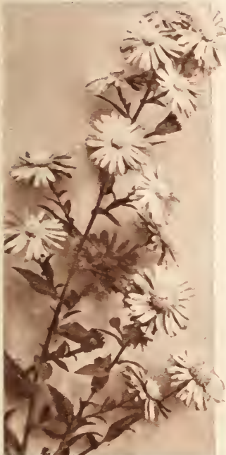
Asters are very dainty

Michaelmas Daisies. In late autumn especially these hardy Asters save the garden from becoming desolate and make it retain some attractiveness. Every plant develops into a large, tall shrub, which is completely covered with the so well-known small wreath-shaped flowers. They grow and flower in every soil and are satisfied with any place in the garden, besides which the branches full of flowers look very gay and graceful in the room, in the comfortless time of decay in autumn. The 5 following varieties are the most beautiful of the hardy Asters and are supplied in heavy quality, and yet at very low price.