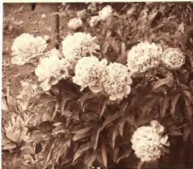
Many gigantic double flowers adorn each Peony