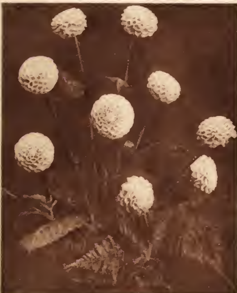
Fine vase of the favorite Dahlia „A. D. Livoni“