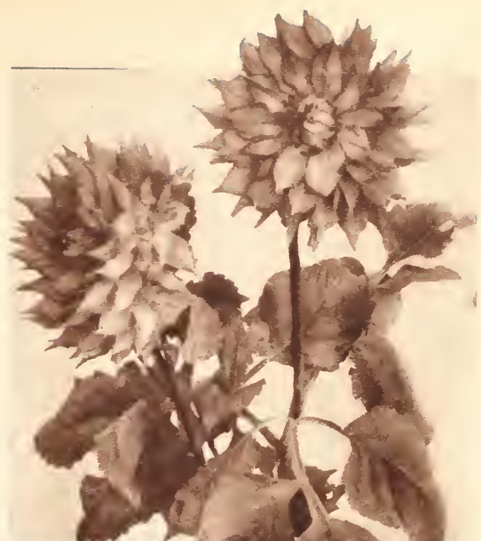
Two gigantic flowers of „Elizabeth Slocombe“