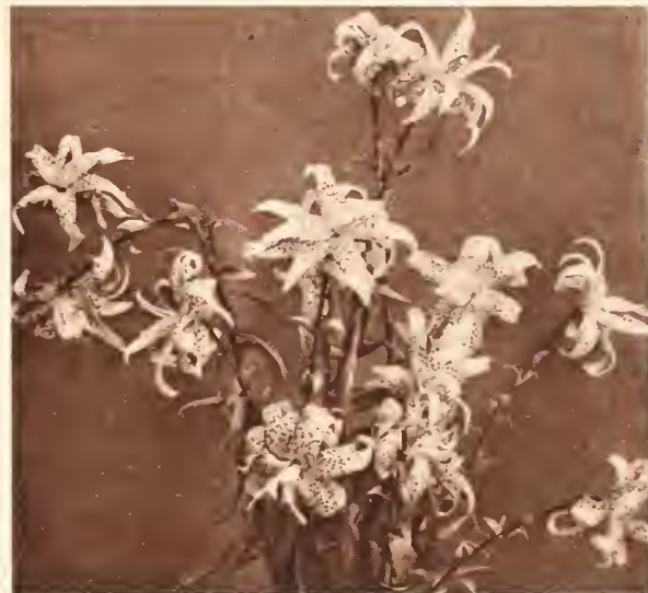
Extremely beautiful, well-known „Lillium Tigrinum“

These Lilies, popular for thousands of years, but much improved of late, are extraordinarily beautiful, both for in- and outdoor cultivation. They are easily drawn into flower with very little trouble, in pots with ordinary garden soil. A fortnight after they are planted, they are already an ornament to the room by their green foliage, and the further they develop the more beautiful they continue to grow until they unfold their large, royal flowers; and when planted in the garden, they need only to be put into the ground and left quietly alone and the delightful flowers, which are the most ideal cutflowers for the home, appear of their own accord. Heavy, picked bulbs guaranteed.