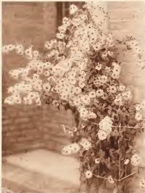
Asters give satisfaction every where