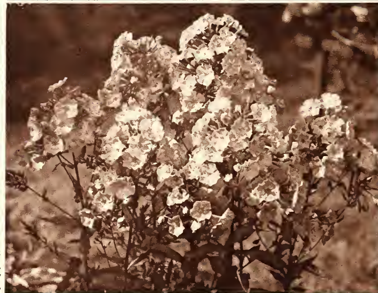
Each Phlox-plant bears hundreds of lovely small flowers