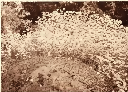
Overwhelming richly-flowering Saxifraga Decipiens