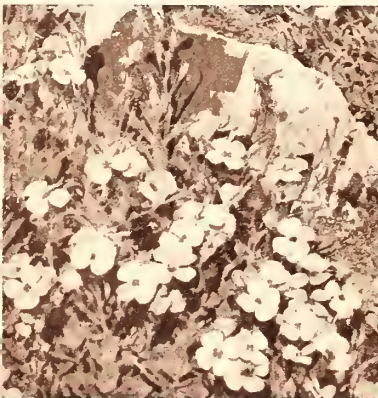
Charming, fragrant Thyme

If it should freeze or snow when you receive this catalogue, don't put off your orders. (See page 19)