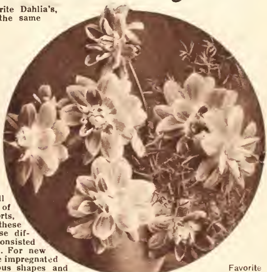
Favorite Dahlia „Mrs. Bowen Tufts“