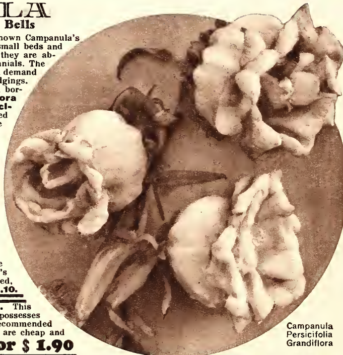
Campanula Persicifolia Grandiflora

CHEAP MIXTURE CAMPANULA'S. This mixture is cultivated from seed, so that it possesses many colors, shades and shapes. Strongly recommended for edgings and groups. The bell-flowers are cheap and yet will give great satisfaction. 12 for $ 1.90 Per 3 $ —.55; per 25 $ 3.50.