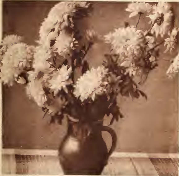
Flowers of the wonderfully beautiful hardy Chrys. „White Doty“