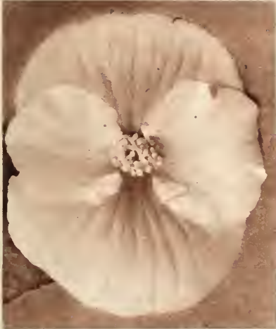
Single Begonia's are very elegant

Begonia's are the very cheapest and most valuable plants for beds and borders because they flower so surprisingly luxuriously for months at a stretch. The quality of these Begonia's is prime, first class. To obtain a fine equal growth the very heaviest bulbs have been picked, which are offered on the preceding page. Every bulb will develop equally strong and will produce a luxury of the well-known dark green leaves and gigantic beautifully shaped flowers in the most brilliant and purest colors. You can plant these Begonia's at once on the spot intended for them, they will further take care of themselves and fill your beds and borders with an unsurpassed wealth of flowers until frost sets in. Never buy hardy Begonia-PLANTS; Begonia-BULBS are more sure to grow, give more satisfaction and cost much less!