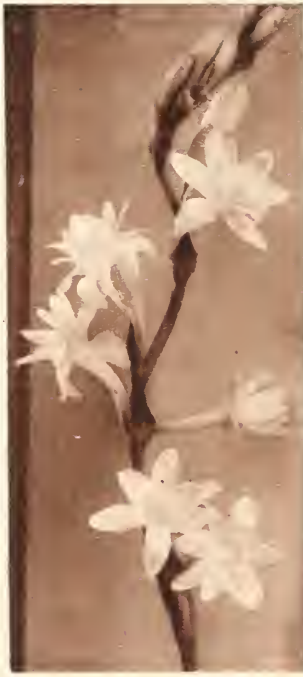
Branch of a Tuberoses „The Pearl“

One of the most beautiful flowers for indoor cultivation. They produce a mass of milky white, thick, delightfully fragrant, nailshaped flowers. Their fragrance and beauty are not surpassed by any other flower.—They require only to be put in pots and boxes, supplied with a little water now and again and they attain their full development in the room quite simply. These Tuberoses are imported by us in prime quality from California and if you consider the beauty of these Californian flowers, you can have some idea of the grand Flora of that country. Double Tuberoses „The Pearl“ , heavy quality, per 3 $ —.25; per 12 $ —.70; per 100 $ 4.50.