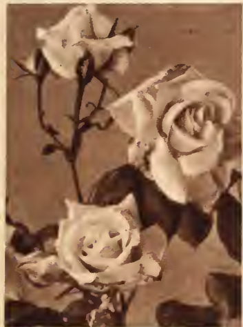
Three flowers of the „Mad. Butterfly“

The price of the above varieties when ordered separately is each $ —.65; 3 for $ 1.75; 12 for $ 6.50; 25 for $ 12.20.