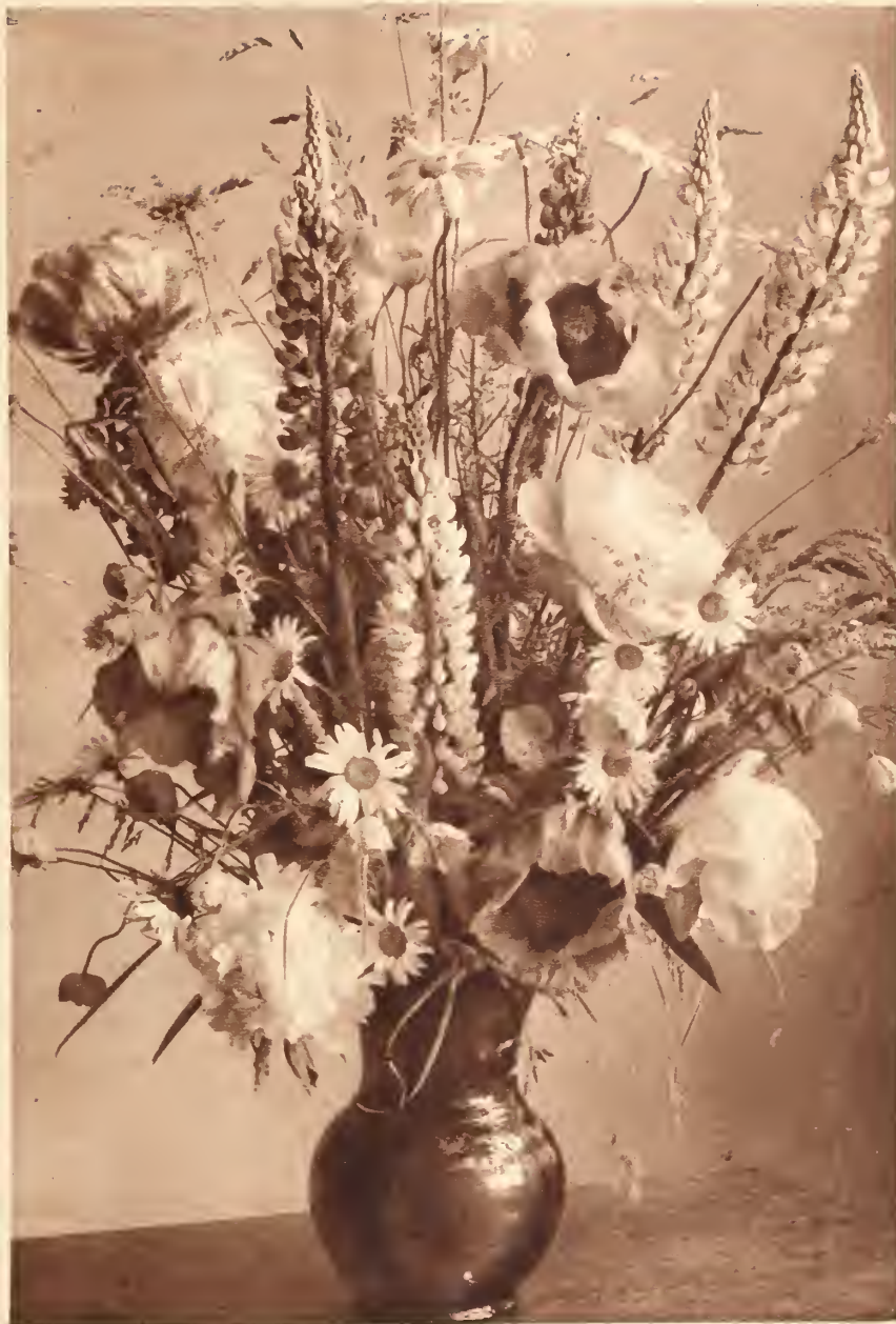
A beautiful fieldbouquet composed of flowers of several varieties of Hardy Perennials

Every variety is separately packed with name on label.