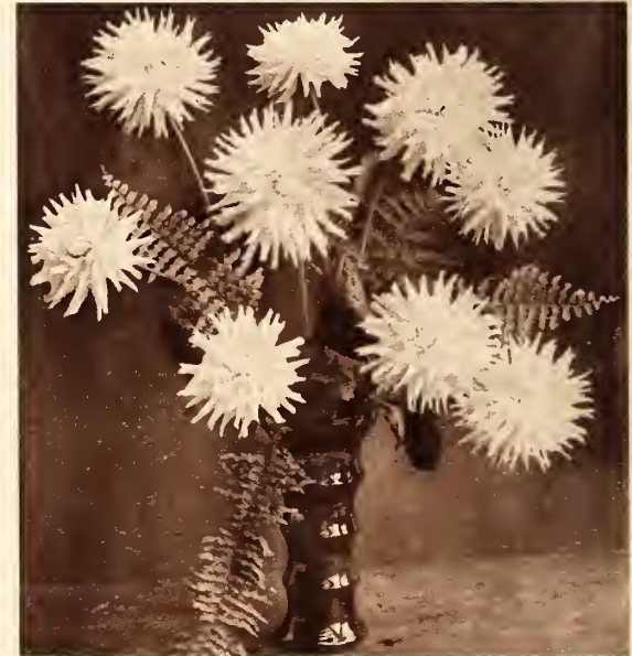
A very fine bouquet of „Majorie Caselton“