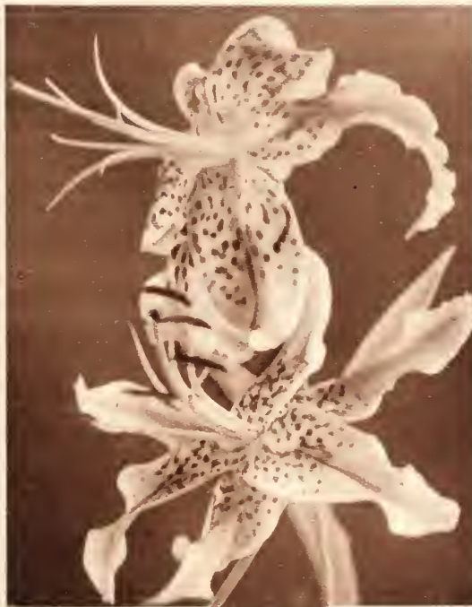
Two gigantic flowers of the very beautiful „Rubrum“ Lily.

How sombre a room looks without a plant or flowers—so intensely cold and unattractive. You feel the chilly surroundings and you freeze in such an atmosphere. How quite different the rooms look where in window boxes, on the table and the mantelpiece flowers and plants smile at you.—Their charm meets you as you enter,—you feel at home at once,—a bright pleasant sphere reigns supreme. The members of the family rejoice over every plant which begins to flower and every further development is followed with excitement. The first named surroundings breed sombre, pessimistic people, the latter a cheerful, optimistic temper in the whole family.