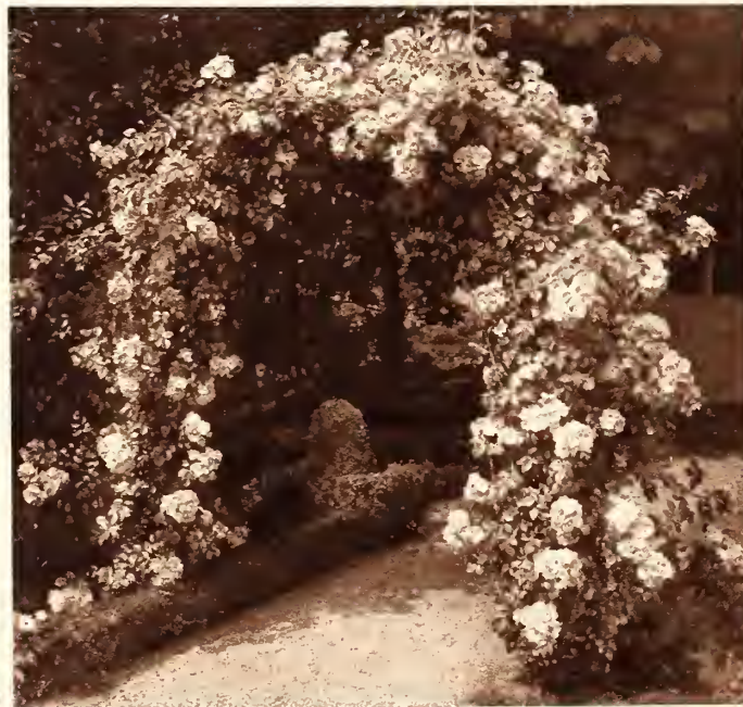
A brilliant porch of some Climbing roses