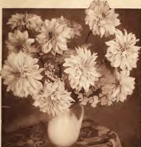
Beautiful bouquet of the giant variety „Amun Ra“