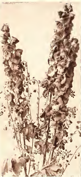
Luxurious large-flowered Delphiniums "Belladonna"

If we compare the present tall, robust, noble Delphiniums with the old, wellknown "Larkspur" it almost seems impossible to us that these luxuriant plants of to-day descend from the rather poor, small plants. At present the Delphinium is a plant, which may be counted amongst the most valuable garden plants. These Delphiniums with their robust flowerstems and long bunches of nobly shaped flowers are indispensable as group plants, in borders and in edgings. The large flat flowers have a diameter from 2 to 3 inches and every bunch of flowers is composed from about 40 to 50 of such large flowers. They have the easy growth in common with their ancestors, and for this reason these refined plants need only to be planted to reappear every year with new splendour. The very best variety in Delphiniums is the "Belladonna", they are the best blue cutflowers, giving three crops during the season. Luxurious large-flowered Delphiniums "Belladonna" heavy quality per 3 $ — .75 ; per 12 $ 2.70 ; per 25 $ 4.90 .