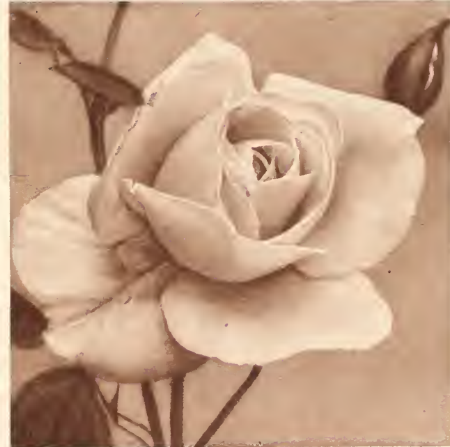
A magnificently shaped „Souvenir de Claudius Pernet“ Rose

We give a reduction of 5% on all orders reaching us from the first zone. Buying from us is always more advantageous! (See page 2)