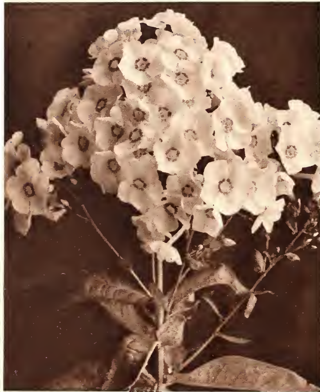
Very elegant Phlox-Decussata plant

An unequalled elegance marks these Autumn Lilacs of old repute, but much improved of late years. Although belonging to the cheapest plants, they are very valuable for the use in beds, groups, edgings and borders. Very soon after the planting, the tall flowerstems shoot out of the plant, which develops strongly; — these stems are closely studded with green, oval-shaped leaves, and branch off in the middle into many sidebranches, on which the large bunches of nailflowers grow, blooming in unequalled luxuriance from June until October. Elegantly and gracefully each small flower exhibits its splendour in the most beautiful colors and shades, and as every Phlox plant produces several hundreds of these small flowers, a great charm emanates from the whole. Heavy quality at unequalled low prices are guaranteed. This year we offer a really unsurpassed assortment, to wit the following elite varieties: