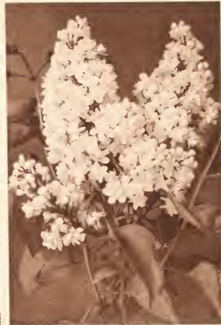
A lovely, beautiful flower-bunch of the „Syringa Vulgaris“

Ideal collection of wondrously beautiful hardy ornamental shrubs. In this collection we supply 1 of each of the above named varieties, in all 12 hardy ornamental Shrubs in 12 superb varieties, in prime quality, at the exceptionally low price of $ 4.90. Each shrub with name on label 12 for $ 4.90