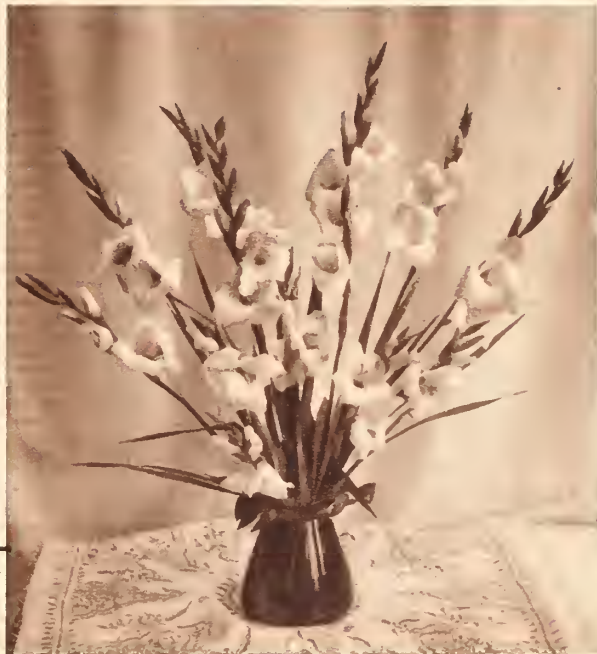
Gladioli are excellent cutflowers