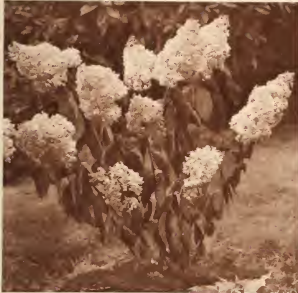
The „Hydrangea“ displays unsurpassed beauty

Ornamental shrubs are indispensable when laying out large gardens. They are strongly recommended for the filling up of big corners, as a back-ground to borders and flower-beds and in very large gardens as centrepieces in lawns. In smaller gardens they look very well planted here and there to relieve the flower-beds and to make the garden as a whole look grander. They are also to be recommended as partitions and render good service as a screen for the wind. — And then the wealth of flower they produce! Take for instance the Lilacs, how very beautiful these are! And the delightfully fragrant Philadelphia! And so every variety has its own shape, its own flowers and its own qualities. We offer 12 varieties of hardy shrubs, all of very heavy quality, in the following 12 picked varieties: