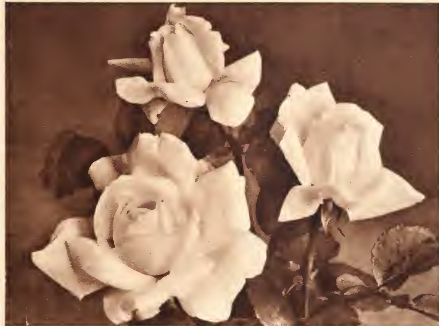
Bud and full-grown flowers of a „Frau Karl Druschki“

If it should freeze or snow when you receive this catalogue, don't put off your orders. (See page 19)