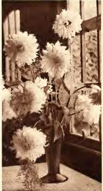
A vase of Decorative Dahlia's