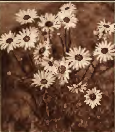
Each Garden-Chrysanthemum has innumerable flowers

In this mixture are put in the first place a number of existing varieties, and secondly (and for this reason this mixture is so very good and attractive) seedlings, consisting of innumerable kinds, varieties and colors, which are not yet brought into market as a special variety. All existing and newer varieties originate from these seedlings. Not only single-flowered but also double-flowered varieties in all possible color-variations can be found in this magnificent mixture. This Rainbow Mixture hardy Asters , per 3 $ —1.50 ; per 12 $ 1.70 ; per 25 $ 3.10 ; per 100 $ 11.60 . 12 for $ 1.70