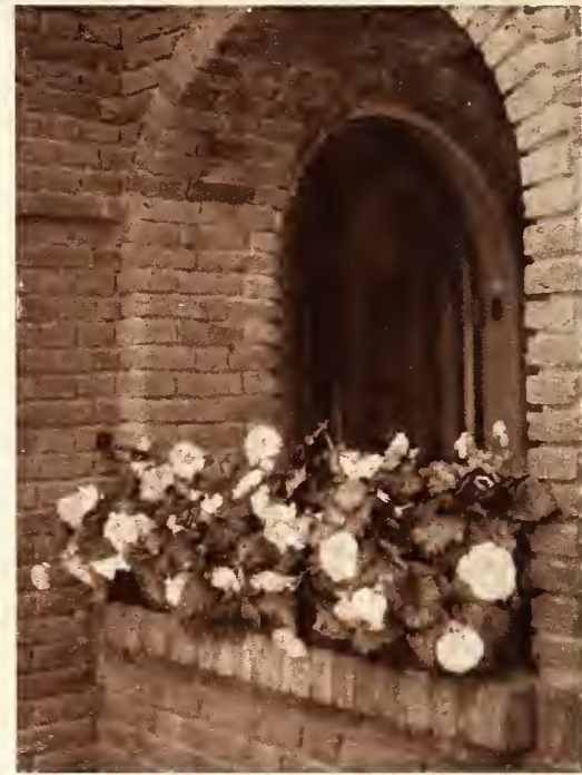
Begonia's bring light and life, even in the most gloomy corners

These heavy Begonia's are at present the chosen flower plants for the decoration of balconies, verandahs and window boxes instead of the much more expensive and not so beautiful Geraniums. In big towns one sees Begonia plants in window-boxes from the lowest to the highest flats. In the country they give a more friendly appearance to the whole village street. In the open conservatories of the great mansions one finds these Begonia's as well as in the balcony and verandah-boxes of many hotels and lunchrooms and not to forget the isolated farms in the valleys as well as on the mountains, where they richly exhibit their large flowers and fresh colors. Their extraordinarily easy growing and flowering is surely not strange to this. They need only to be planted and to be well provided with water, then they will produce, until frost sets in, an unsurpassed luxury of flowers. In pots, boxes and baskets, in the room and in the conservatory they develop quickly into beautiful indoor plants with a wealth of flowers and foliage. As for all these purposes so very much is required from the bulbs, we offer only picked heavy bulbs, which have so much substance to dispose of, that failure is altogether excluded. This picked quality is, as a matter of course, also very suitable for parks, especially when an extraordinary heavy growth is required, for instance for exhibition purposes.