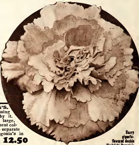
Heavy gigantic-flowered double Fimbriata Begonia's