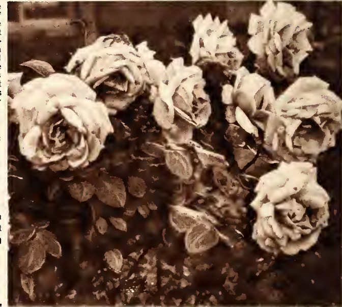
Rose bush with many large, excellent flowers

After having offered all possible varieties separately, we now come with a collection of the same large-flowered everblooming roses in separate colors. There exist many hundreds of varieties of roses, the 25 varieties mentioned above are the most favorite, and therefore of these varieties the greatest quantities are cultivated. — But now in this collection we aim at selling those varieties, which are too small in number to be offered for sale separately. — And we have classified these in 5 principal colors. — This is also the reason why we can supply this collection in the same prime quality, still cheaper. Whether it is more beautiful or better suitable to you to have one rose of each color, or five roses of one color, we dare not advise; but we do assure you, you must have roses in your garden. — For the rose is the flower of flowers, the queen in the realm of flowers! A garden without those most delightful gifts of nature is not complete and does not exhibit the luxuriance, which always strikes us in every garden, in which roses are to be found. In this collection we supply