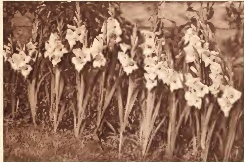
A magnificent, decorative border of large-flowered Gladioli