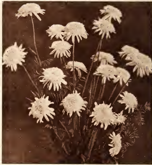
Pyrethrums are cutflowers of unsurpassed beauty

One of the most refined perennials for cutflowers. Although they possess the greatest renown as cutflowers, they also belong to the most beautiful plants for small beds, groups and borders, being low to medium sized perennials. From the broadly outgrowing plant, the thin, tough stems shoot out, completely surrounded underneath by the finely chiselled, green leaves and bearing the large, delightful flowers. As said before, they are extremely suitable for cutflowers and everybody, even those people who know nothing at all about the making up of bouquets, can arrange those Pyrethrum flowers into elegant, graceful bouquets, as they possess a grace of their own which with other flowers is obtained only by the art of flower binding. — And you will never be able to buy such beautiful and fresh flowers as you can cut from your own garden and of course also never for so little money. These refined majestic Pyrethrums are delivered in a finest mixture of English varieties and in heavy quality.