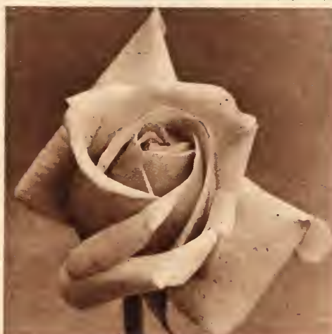
Elegant bud of a Radiance Rose

If it should freeze or snow when you receive this catalogue, don't put off your orders. (See page 19)