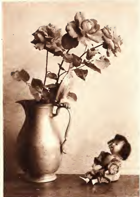
Already a few roses form an artistic bouquet

The price of the above colors, when ordered separately, is: each $ —.60; 3 for $ 1.60; 12 for $ 5.75; 25 for $ 10.90.