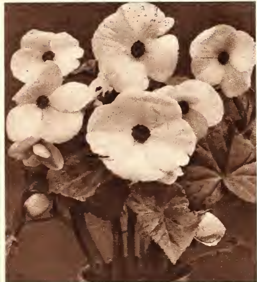
Plant of a gigantic-flowered single Begonia