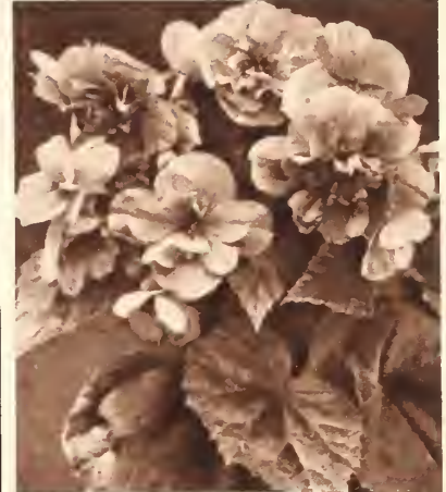
Innumerable small petals fill each double Begonia flower