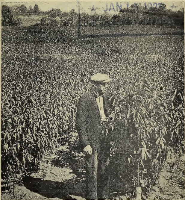
Partial view of block of young Peach Trees.

The Barnes Brothers Nursery Company Yalesville, Connecticut