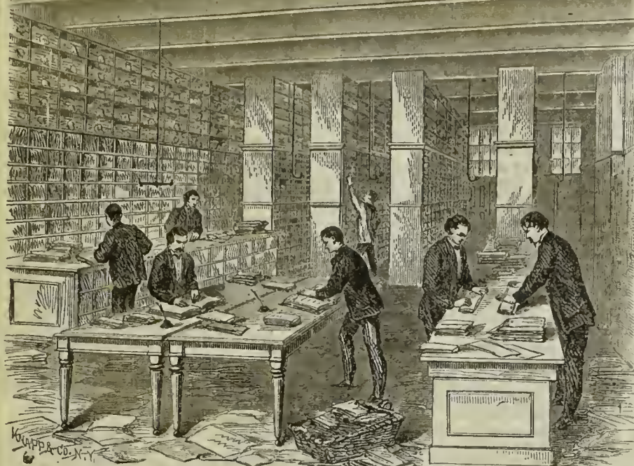
THE NEWSPAPER ROOM.

A Pamphlet of 32 pages, containing a list of over 1,000 Newspapers, which are particularly recommended to advertisers, with estimates showing the cost of any advertisement, sent free on receipt of Stamp.