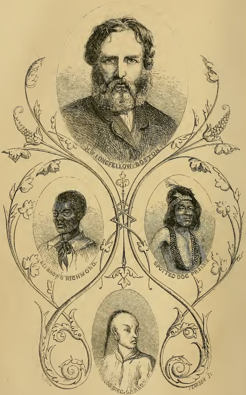
THE FOUR RACES.