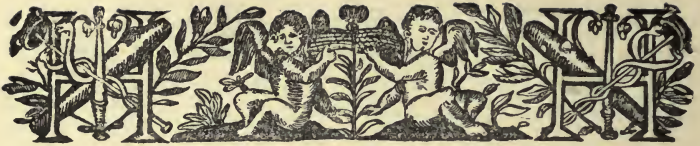
ILLUSTRATION TO VOL. XVII