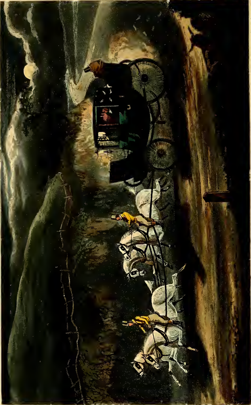
Aqua by E. Diocoro.