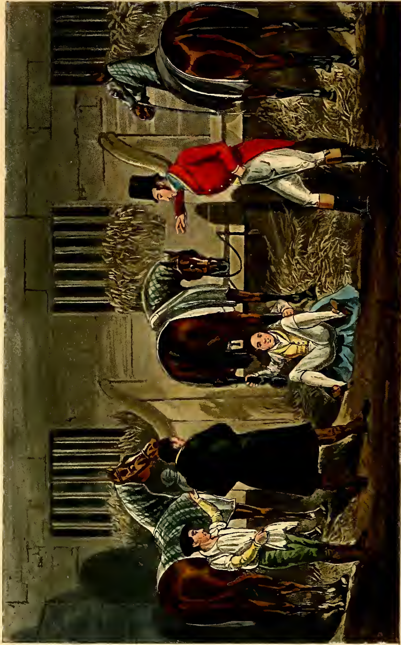
Drawn & Etched by H. Alken.