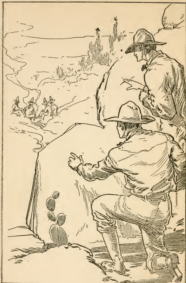
Around a Campfire Sat Four Bandits.