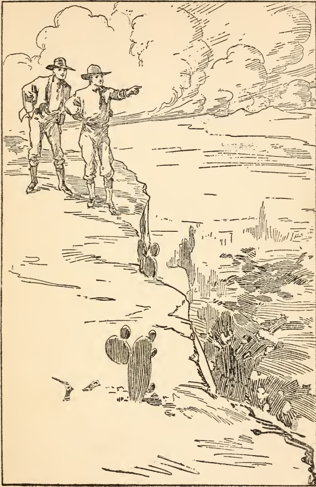
They Could Look Far Out Over the Country.