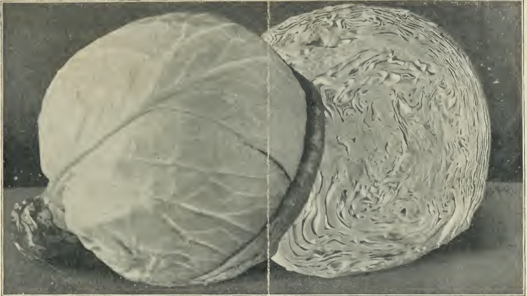
HOUSER CABBAGE, from photograph, showing SHAPE and SOLIDITY of head

LIBRARY RECEIVED JUL 24 1923 U. S. Department of Agriculture