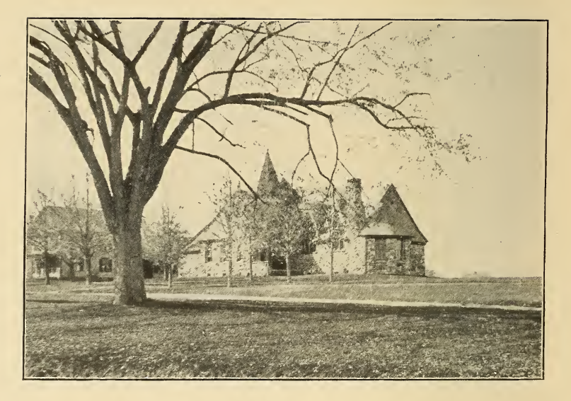
PETERSHAM MEMORIAL LIBRARY