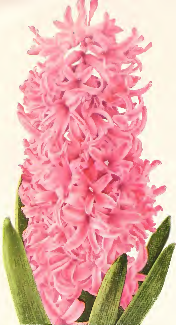
QUEEN OF THE PINKS

One bulb each of the varieties pictured on this page and on the front cover of this catalog: Grand Maitre, La Victoire, L'Innocence, Queen of the Pinks, Myosotis and City of Haarlem. Six bulbs in all for $1.39. Postpaid.