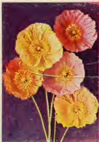
POPPY GARTFORD Double Queen Poppies