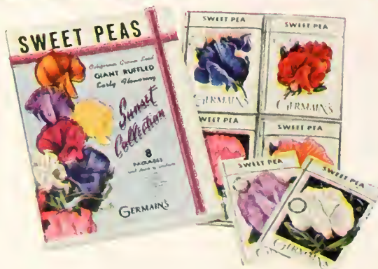
Early Spencer SUNSET COLLECTION

Six splendid colors for cutting and garden display, and one package of plant food tablets. Complete in large 6 x 9 in. collection package, illustrated in full color. Reg. 75c Value for 50c Postpaid