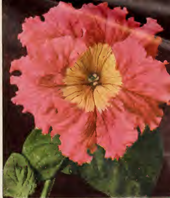
PETUNIA GIANTS OF CALIFORNIA

One packet each of the four King Larkspurs, plus one packet of Giant Imperial Larkspurs Mixed (5 pkts.) for 80c