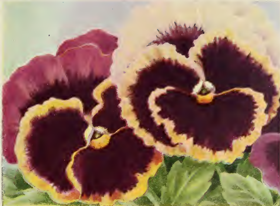
PANSY SWISS GIANTS MIXED