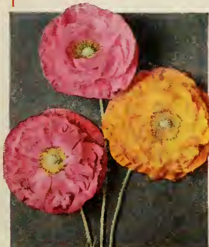
DOUBLE QUEEN POPPY