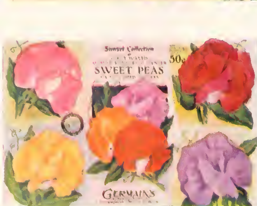
Summer Flowering SUNSET COLLECTION

4279 Giant Ruffled Early Spencer Mixed. Pkt. 10c; 1/2 Oz. 25c; Oz. 50c; 1/4 Lb. $1.50; Lb. $5.00; Postpaid.