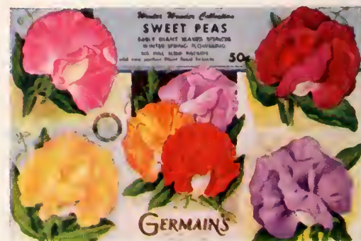
Early Flowering WINTER WONDER COLLECTION

Six full-sized packets of Giant Early or Winter Spencer Sweet Peas—PLUS—package of plant food tablets. Complete in large 6 x 9 in. package in natural colors. Reg. 75c. A special at 50c Postpaid