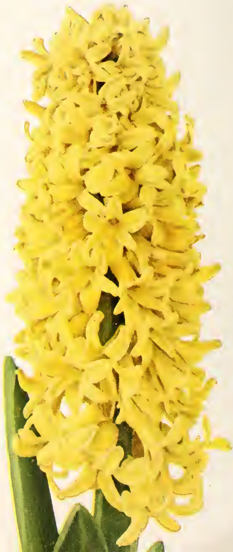
CITY OF HAARLEM

One Domestic Hyacinth Vase. One Exhibition size bulb, color, your choice. Package of charcoal, paper cone and cultural direction. Beautifully boxed, suitable as a gift for any occasion. $1.39 Postpaid.