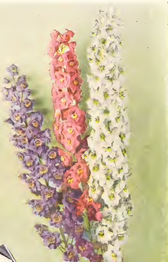
PACIFIC GIANT DELPHINIUM

2631 RED, WHITE AND BLUE CUT FLOWER MIXTURE. Pkt. 20c 3 for 50c