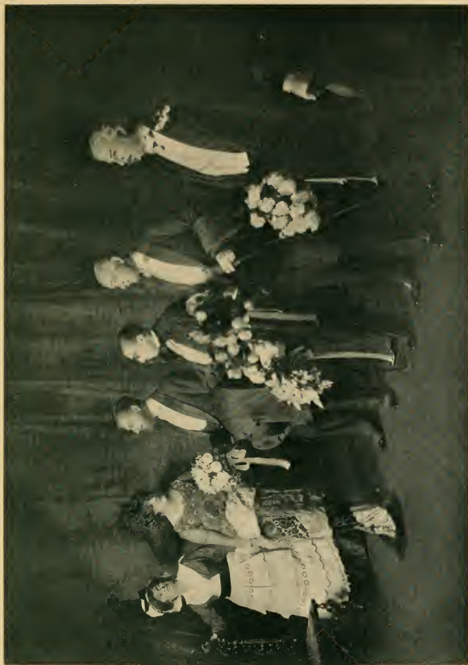
"MANY HAPPY RETURNS"