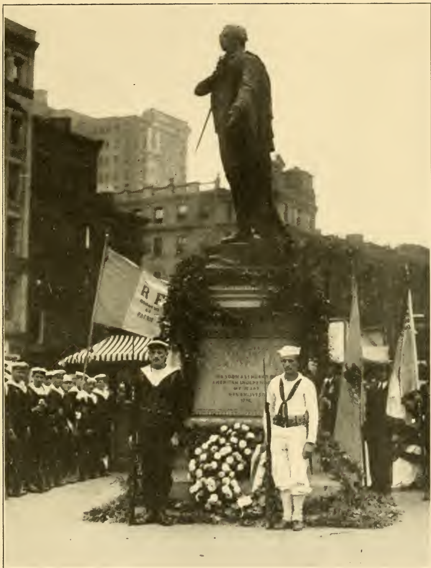
The Lafayette Monument, Union Square, N. Y., on Lafayette Day, Sept. 6, 1918.