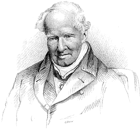
Alexander von Humboldt