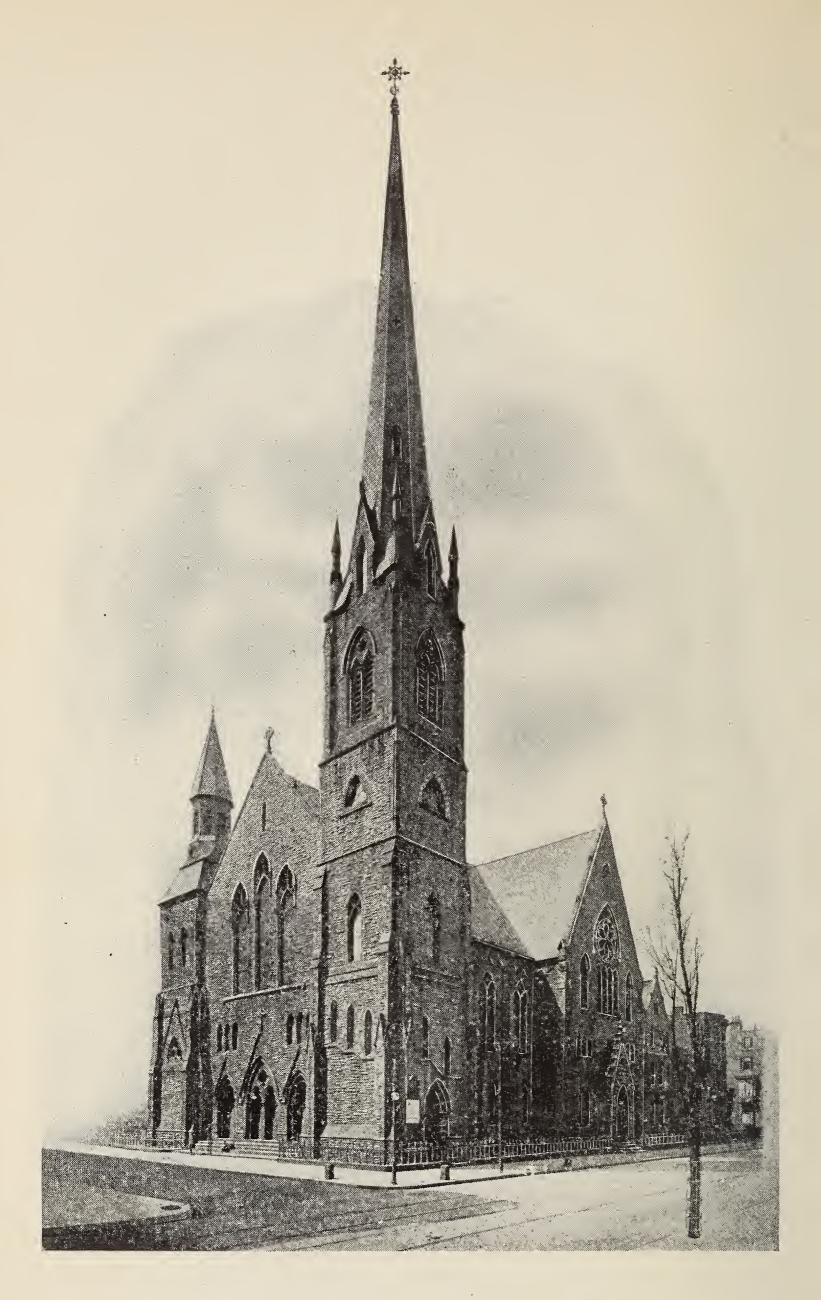
ST. PAUL METHODIST EPISCOPAL CHURCH CINCINNATI