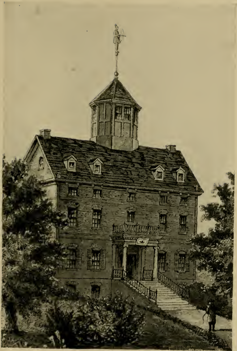
THE PROVINCE HOUSE.