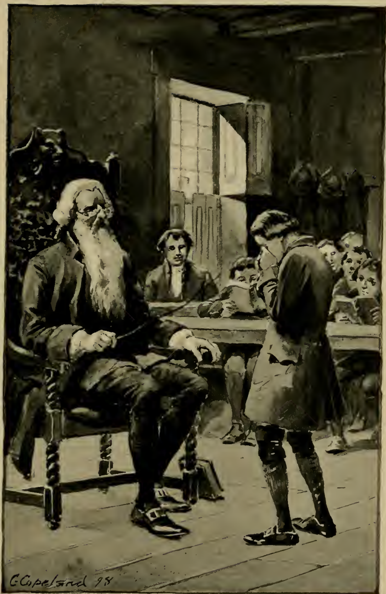
"THE OLD CHAIR IS NOW A JUDGMENT-SEAT."