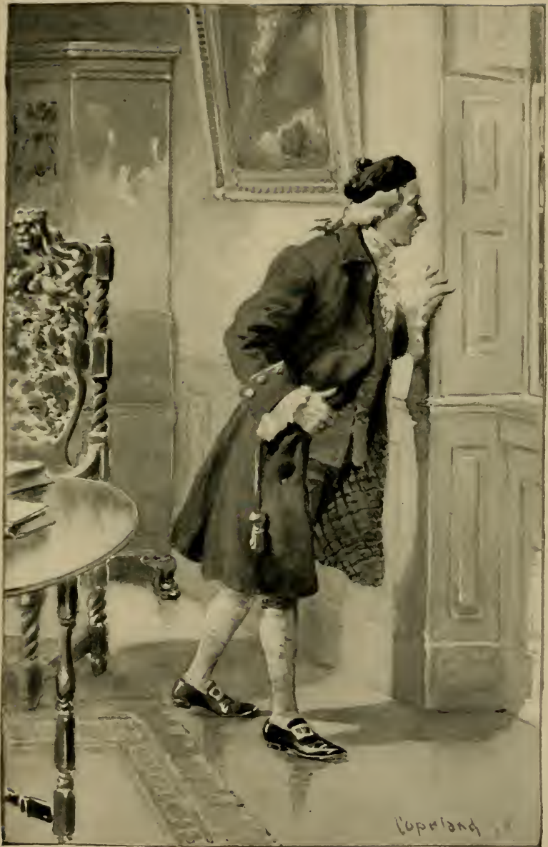
"HE CREPT SOFTLY TO THE WINDOW."