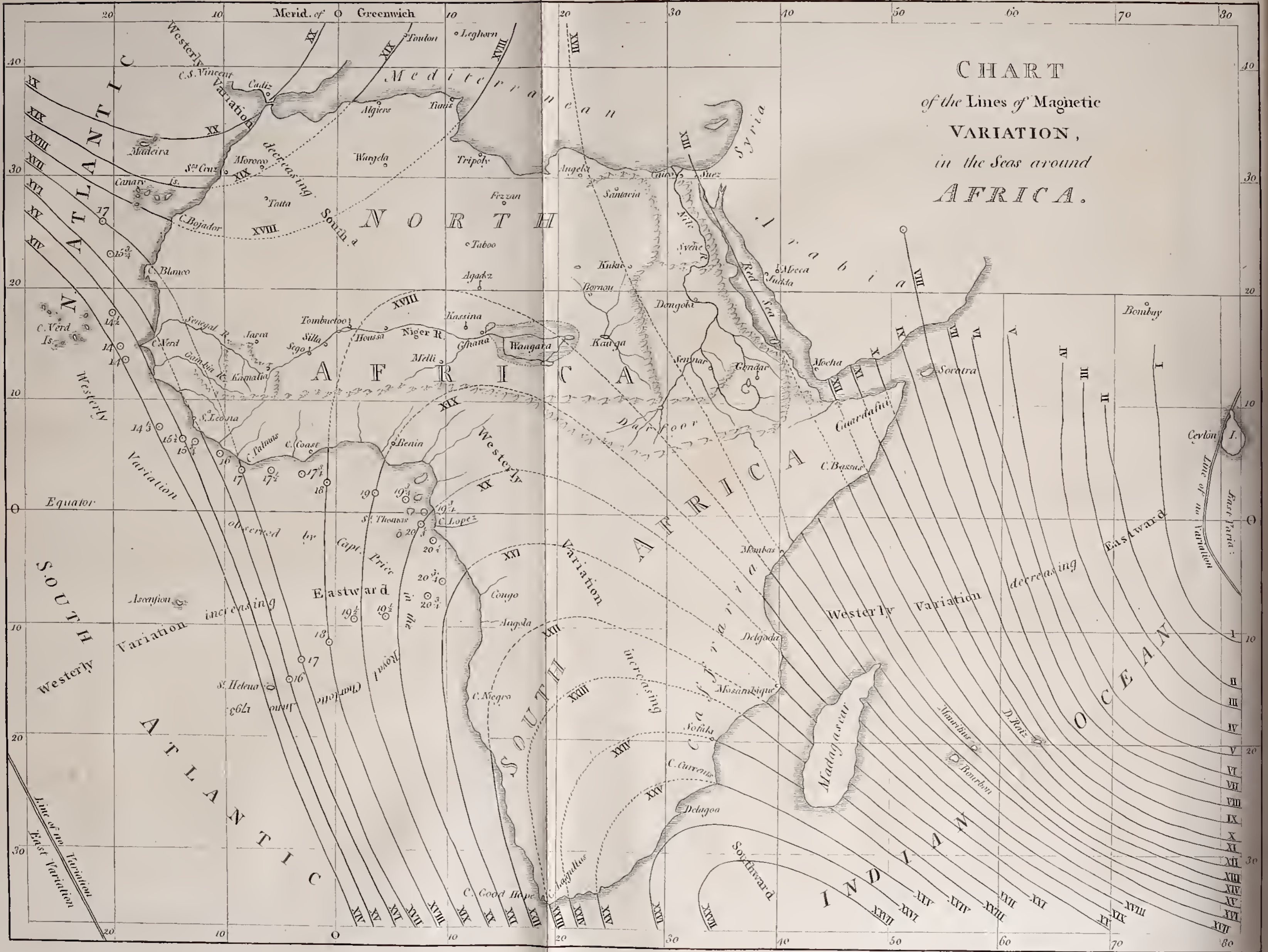
CHART of the Lines of Magnetic VARIATION, in the Seas around AFRICA.