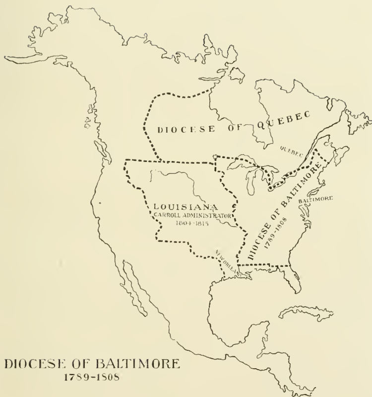
DIocese OF BALTIMORE 1789-1805