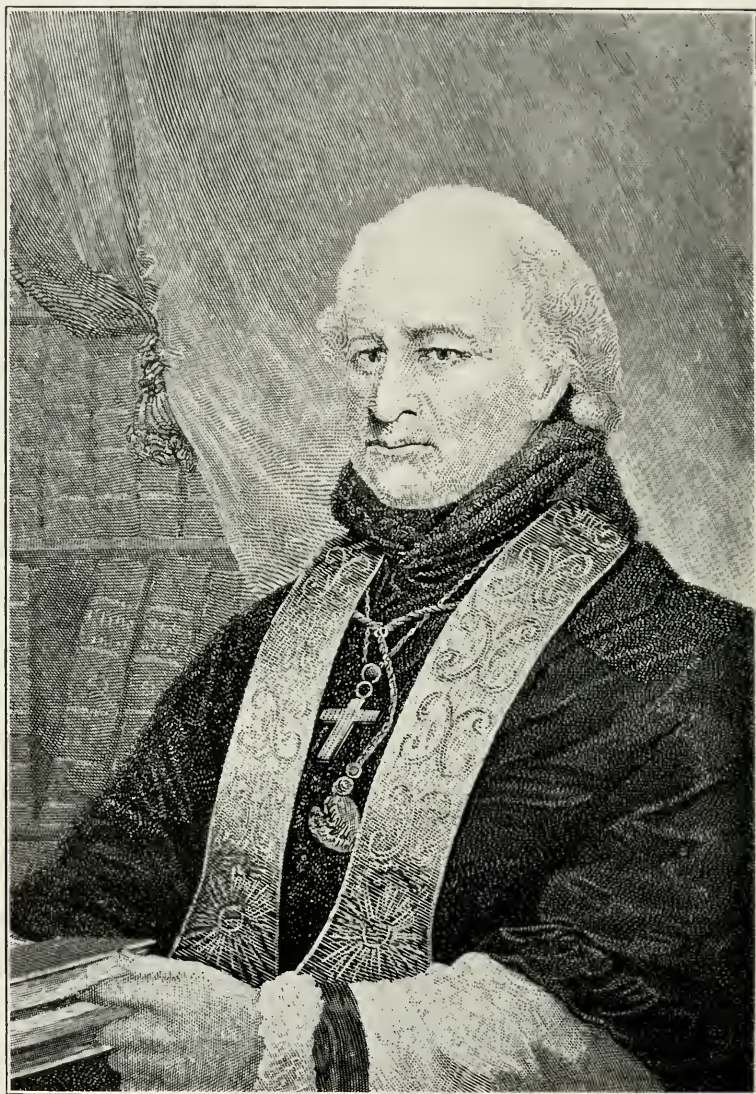
ARCHBISHOP JOHN CARROLL