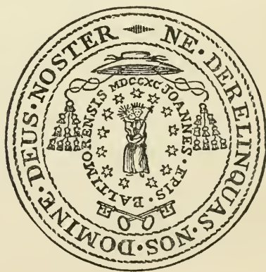
SEAL OF BISHOP CARROLL

Laws were needed to guide these groups of Catholics, priests and people, along the right way. Strict regulations were necessary if church discipline were to be properly established. The mind of the Bishop and of his clergy on mooted points of opinion had to be made known to the Catholic laity. Restraint in the privileges of the lay trustees was wanted in almost all the large Catholic centres. Dr. Carroll knew his country and his Church better than any Catholic in America at that time; but with his usual prudence, he studied the whole situation carefully before sending out the formal call to his priests to meet him in America's first Synod.