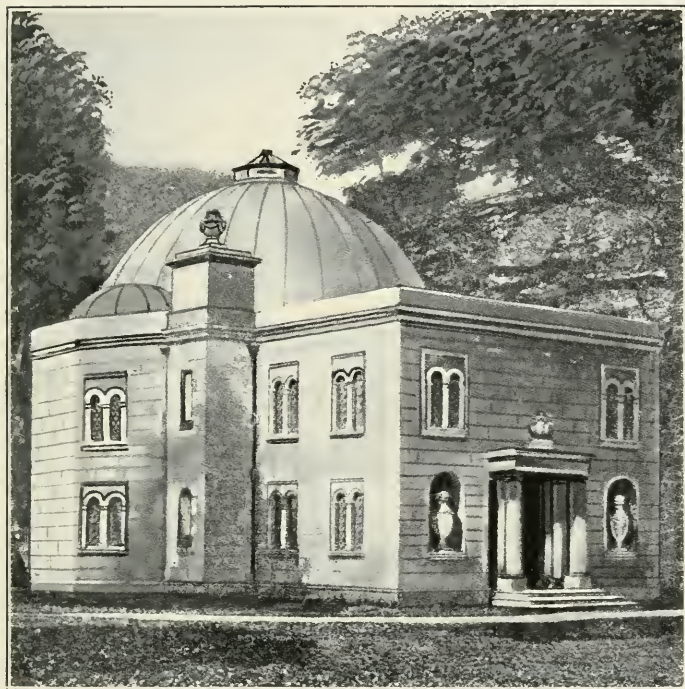
CHAPEL AT LULWORTH CASTLE