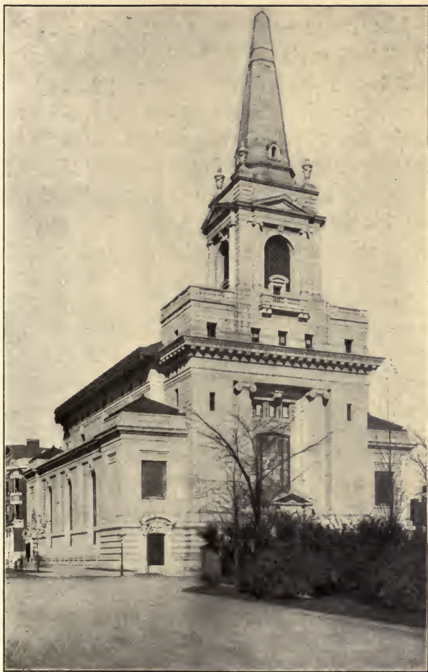
THE FIRST CHURCH OF CHRIST, SCIENTIST, CENTRAL PARK WEST AND 96TH STREET, NEW YORK