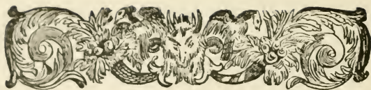
ILLUSTRATION TO VOL. X