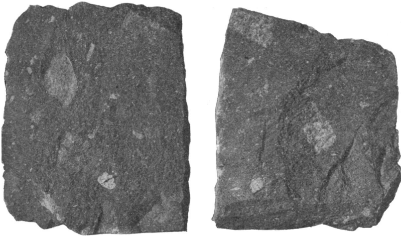
FIG. 5.—Dwyka tillite to left, Lower Huronian to right.

No underlying striated surfaces or roches moutonnées have been found beneath the Lower Huronian tillite; while beautifully glaciated surfaces are displayed beneath the northern Dwyka. It should be remembered, however, that no such surfaces have been found under the southern Dwyka, where the conglomerate passes downward into