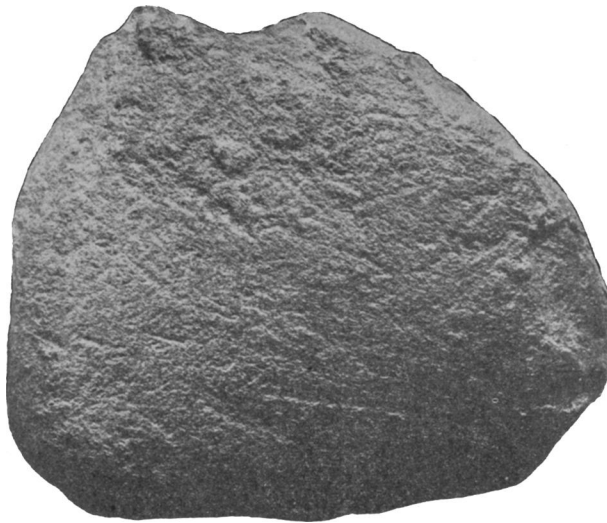
FIG. 2.—Lower Huronian "soled" boulder.

which was measured reaching diameters of 5 \times 3 \times 3 feet; but the largest boulder seen, near Temagami station, was of greenstone showing pillow structure, having diameters of 8 \times 5 ft. as exposed on an ice-smoothed surface. Many of these boulders are several tons in weight and some of the granites are miles away from the nearest known source. The smaller pebbles of felsite often show exactly the same subangular shapes with irregular well-polished surfaces as are found on pebbles of fine-grained rock in later boulder clays.