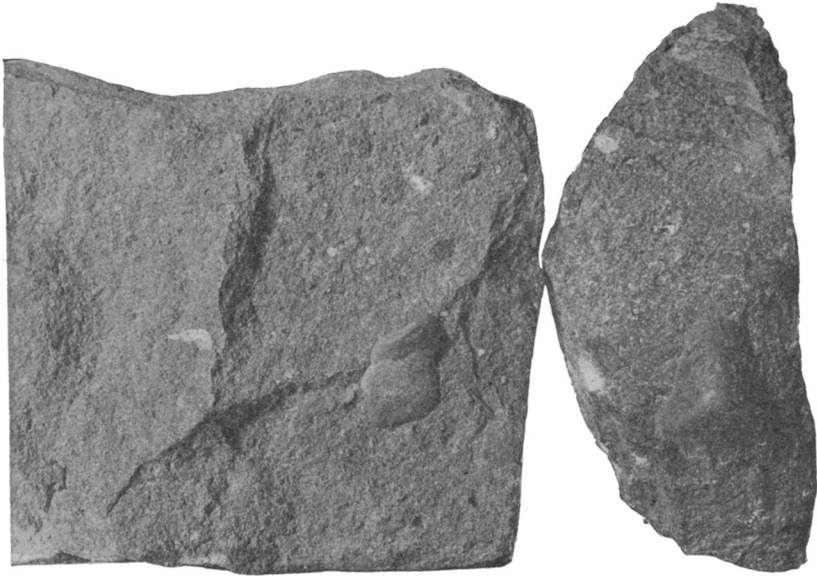
FIG. 4.—Polished pebbles in ancient till. Dwyka to left, Lower Huronian to right.

From the outline just given it will be seen that every feature of the Lower Huronian rocks has its close parallel in the complex of boulder clays and sediments of the Pleistocene, though the latter are, of course, loose and unconsolidated. A comparison with the Dwyka conglomerate of Permo-Carboniferous times is more convincing still, since the Dwyka is now solid rock. Hand specimens of the two tillites might easily be interchanged by one not familiar with them. Specimens from Matjesfontein in Cape Colony or N'gotsche Mountain in