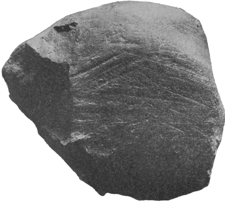
FIG. 1.—Lower Huronian "soled" boulder with striations in several directions.

mens collected were mixed with Pleistocene boulder clay they could hardly be distinguished from the other stones in the clay unless perhaps by lacking the polish found on some from the Pleistocene. When it is remembered that the Lower Huronian tillite has undergone mountain-building stresses and a certain amount of metamorphism, it is astonishing to find the striations so perfectly preserved,