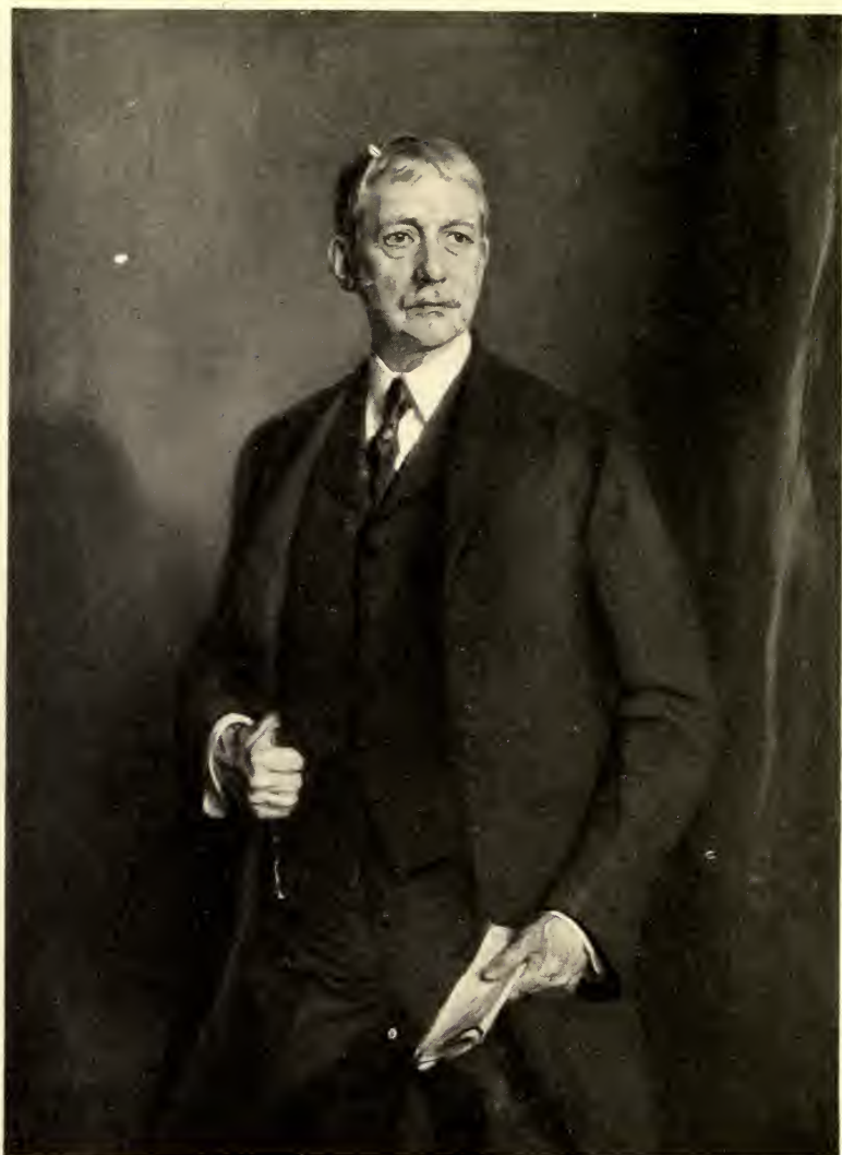
Portrait by Phllp A. de László.