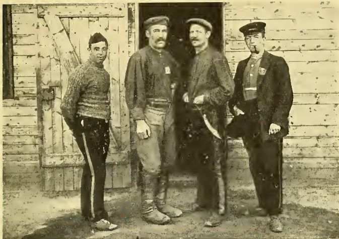
FELLOW PRISONERS AT GEISSEN. FROM LEFT TO RIGHT: A CHESHIRE REGIMENT MAN, A SIBERIAN RUSSIAN, AN EAST YORKSHIRE LIGHT INFANTRYMAN AND A GORDON HIGHLANDER.