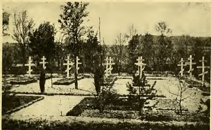
THE CEMETERY AT CELLE LAAGER Z I CAMP.