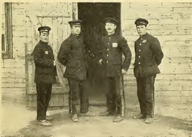
FELLOW PRISONERS AT GEISSEN. THREE HIGHLANDERS AND A YORKSHIRE LIGHT INFANTRYMAN.