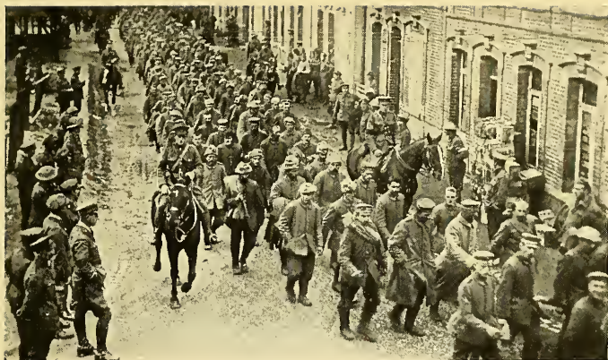
GERMAN PRISONERS MARCHING THROUGH GOOD NATURED ENGLISH CROWDS AT SOUTHAMPTON.