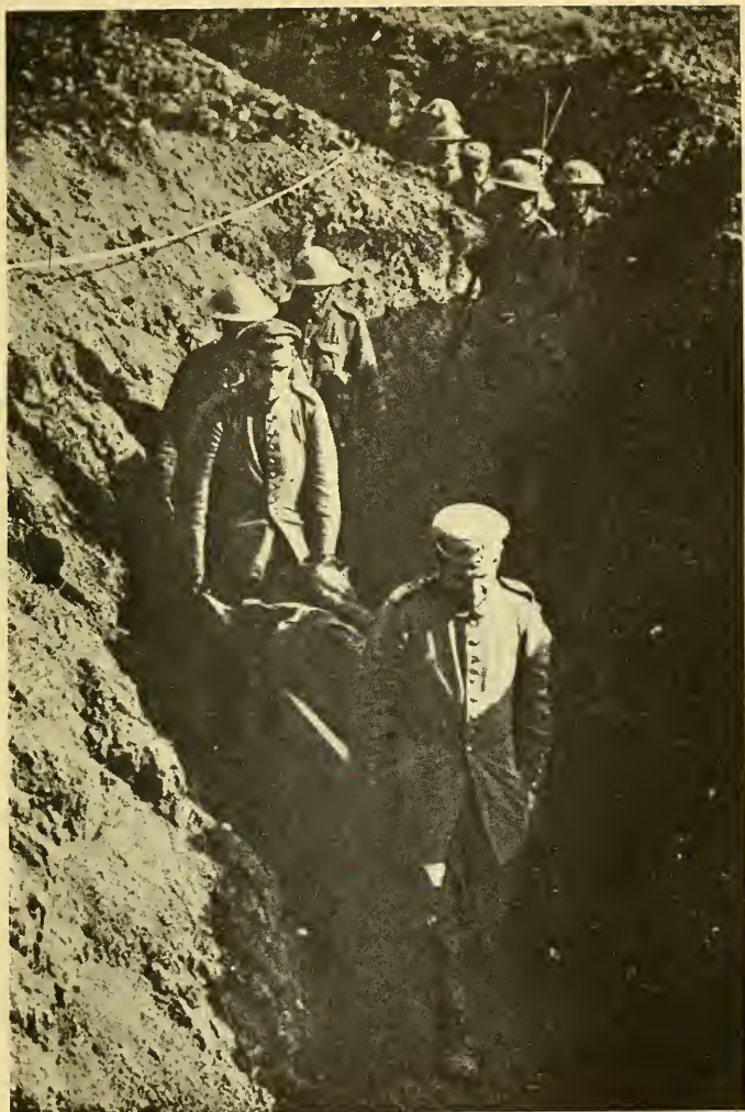
GERMAN PRISONERS AFTER A SUCCESSFUL CANADIAN ATTACK, BRINGING WOUNDED MEN DOWN A COMMUNICATION TRENCH.