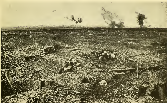
HIGH EXPLOSIVES BURSTING OVER GERMAN TRENCHES. BRITISH DEAD IN FOREGROUND.