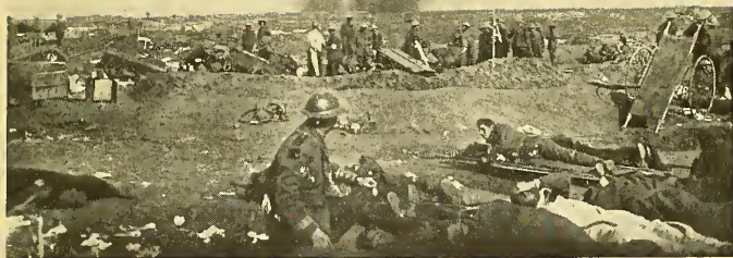
BRITISH WOUNDED WAITING FOR TRANSPORTATION TO A DRESSING STATION.