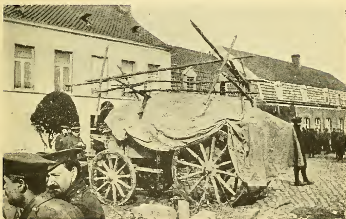
THE PRINCESS PATRICIAS IN BILLETS AT WESTOUTRE, BELGIUM. ON TOP OF WAGON IN FOREGROUND IS "KNIFE-REST" TYPE OF WIRE ENTANGLEMENTS.