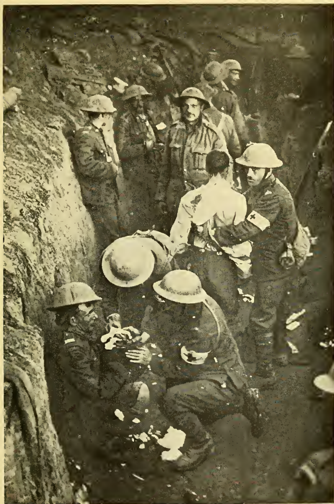
WOUNDED CANADIANS RECEIVING FIRST AID IN A SUPPORT TRENCH AFTER AN ATTACK.