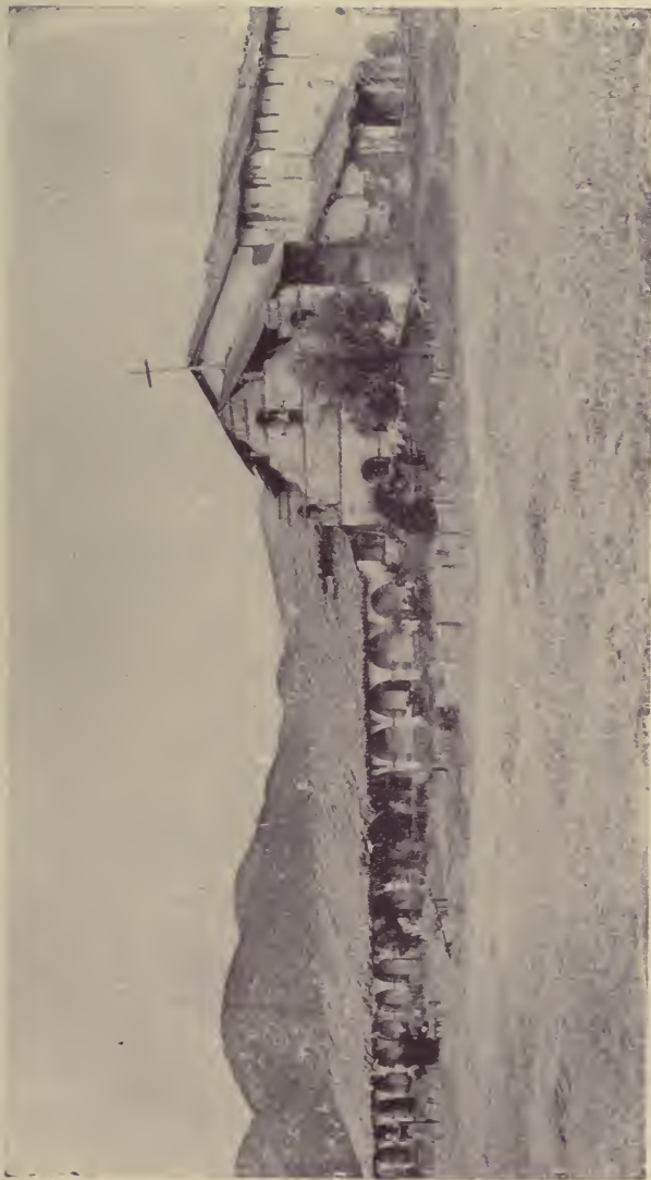
"Crumble to ruins the old Franciscan Missions."