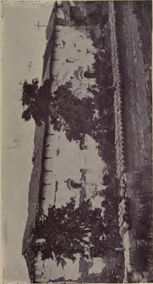
"Passing monument of California's first page of written history."