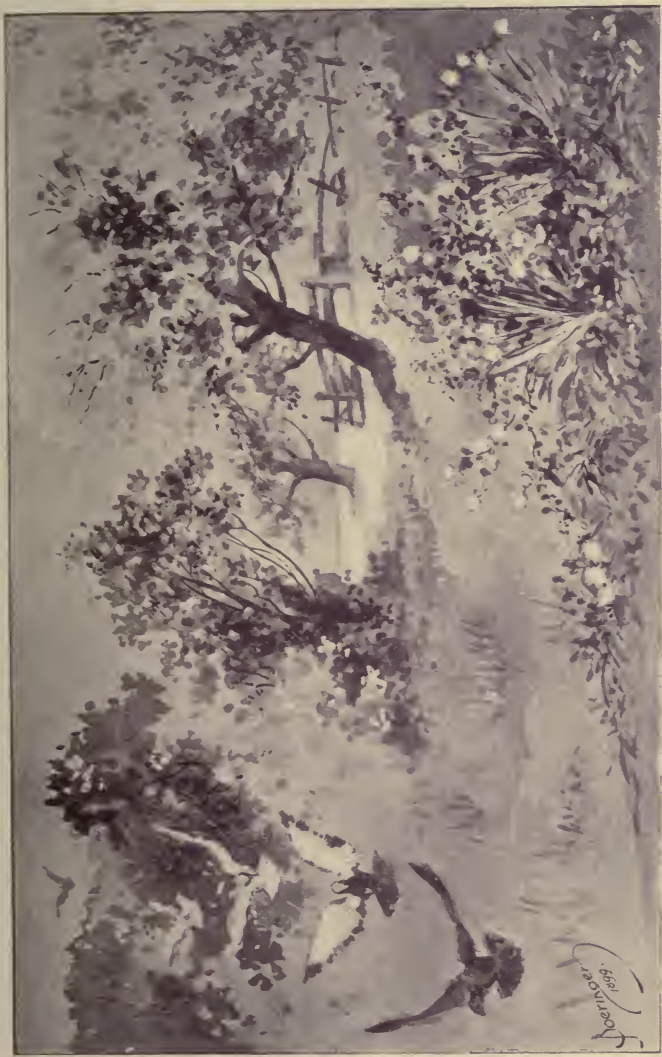
“Half a year of clouds and flowers.”