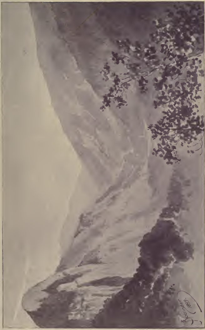
"Far down the fragrant canyons sing the green and troubled rivers."