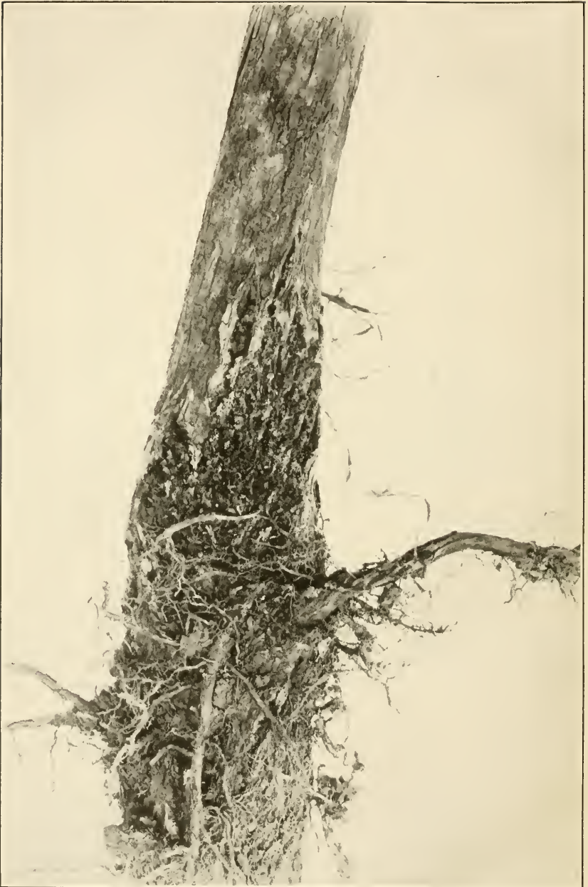
ROOT OF COFFEE TREE. ROUGHENED BARK DUE TO NEMATODES. ROOTS KILLED BY "WHITE" ROOT FUNGUS.