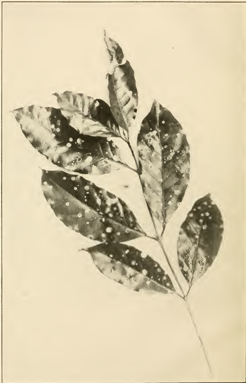
COFFEE LEAVES ATTACKED BY THE LEAF SPOT FUNGUS ( STILBELLA FLAVIDA ).