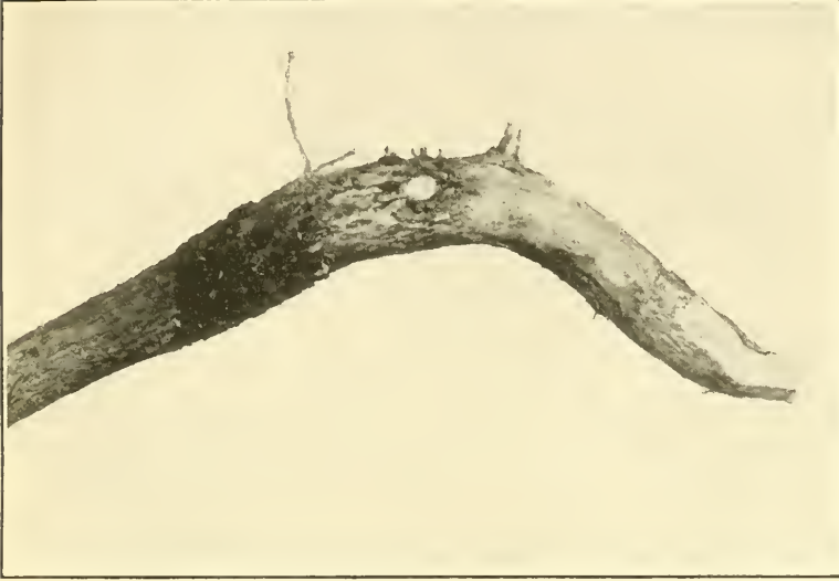
FIG. 2.—IMPERFECT FORM OF ROOT DISEASE FUNGUS ( DEMATOPHORA SP.) ON PETIVERIA PLANTS.