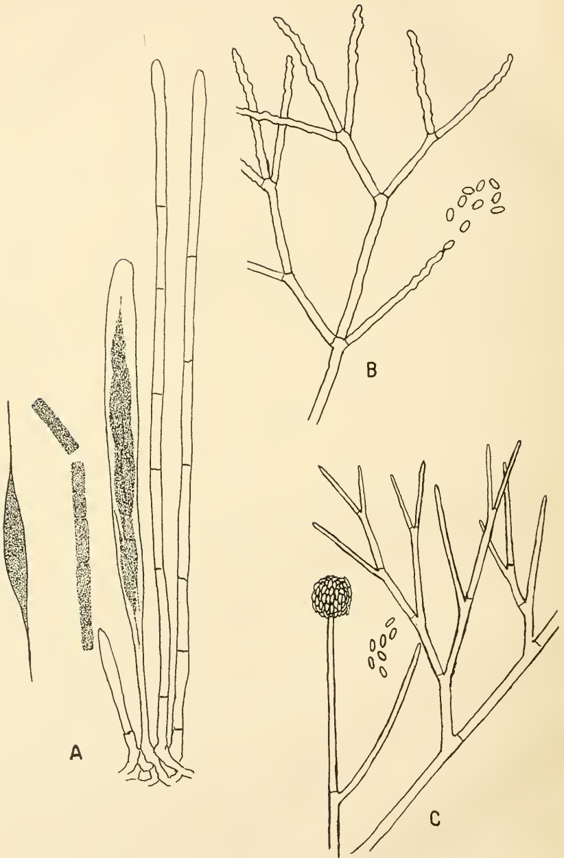
A.—ASCUS AND SPORES OF ROSELLINIA SP. (X450). B.—HYPHÆ AND SPORES OF DEMATOPHORA SP. (X450). C.—HYPHÆ AND SPORES OF CEPHALOSPORIUM SP. (X450).