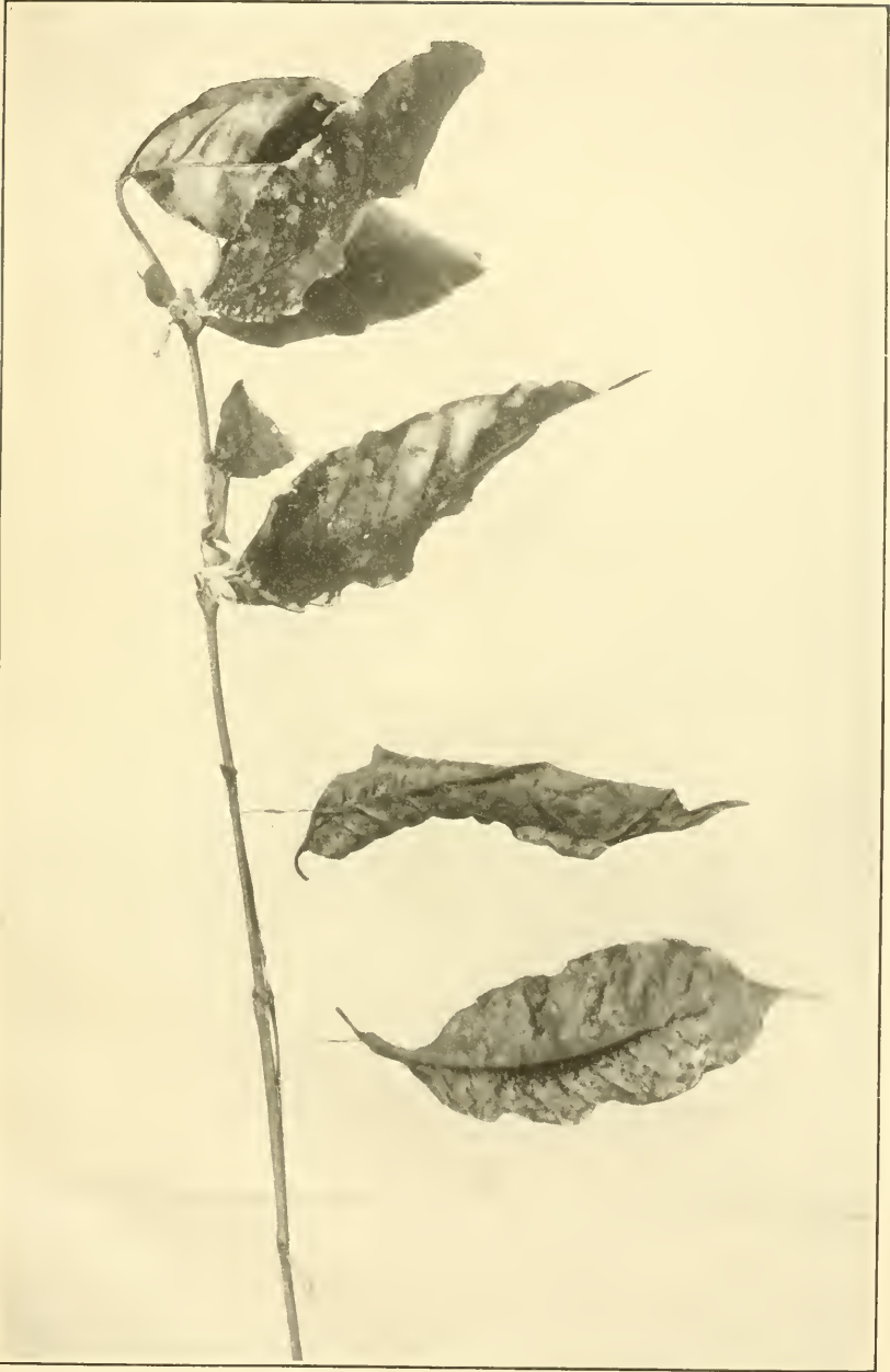
COFFEE BRANCH ATTACKED BY THREAD BLIGHT ( PELLICULARIA KOLEROGA ), SHOWING CHARACTERISTIC SUSPENSION OF LEAVES BY THREADS OF THE FUNGUS.