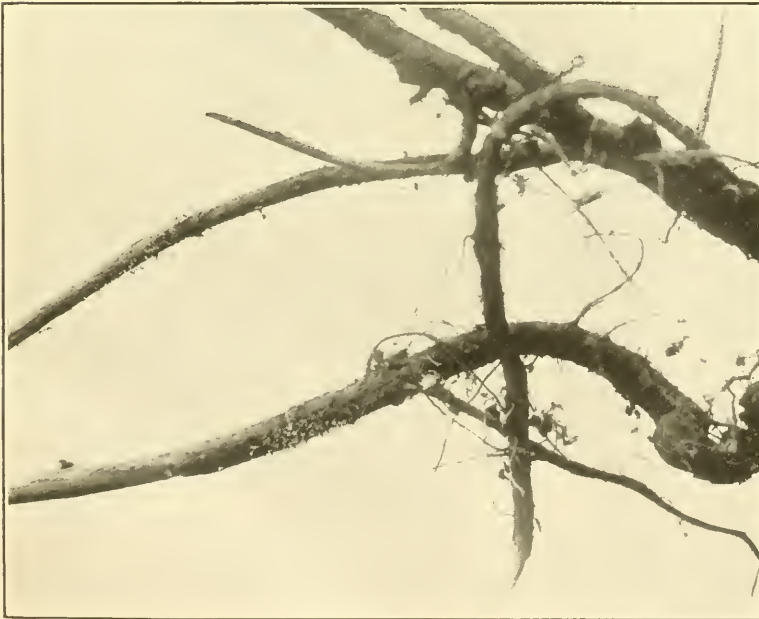
FIG. 1.—COFFEE TREE ATTACKED BY THE ROOT DISEASE FUNGUS ( ROSELLINIA SP.).