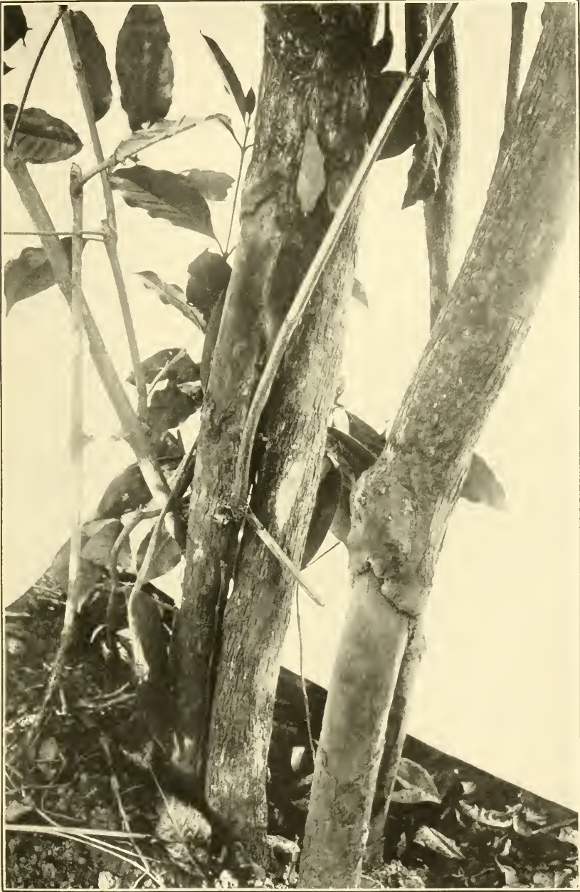
TRUNK OF COFFEE TREE WITH FUSARIUM DISEASE PRODUCED BY INOCULATION.