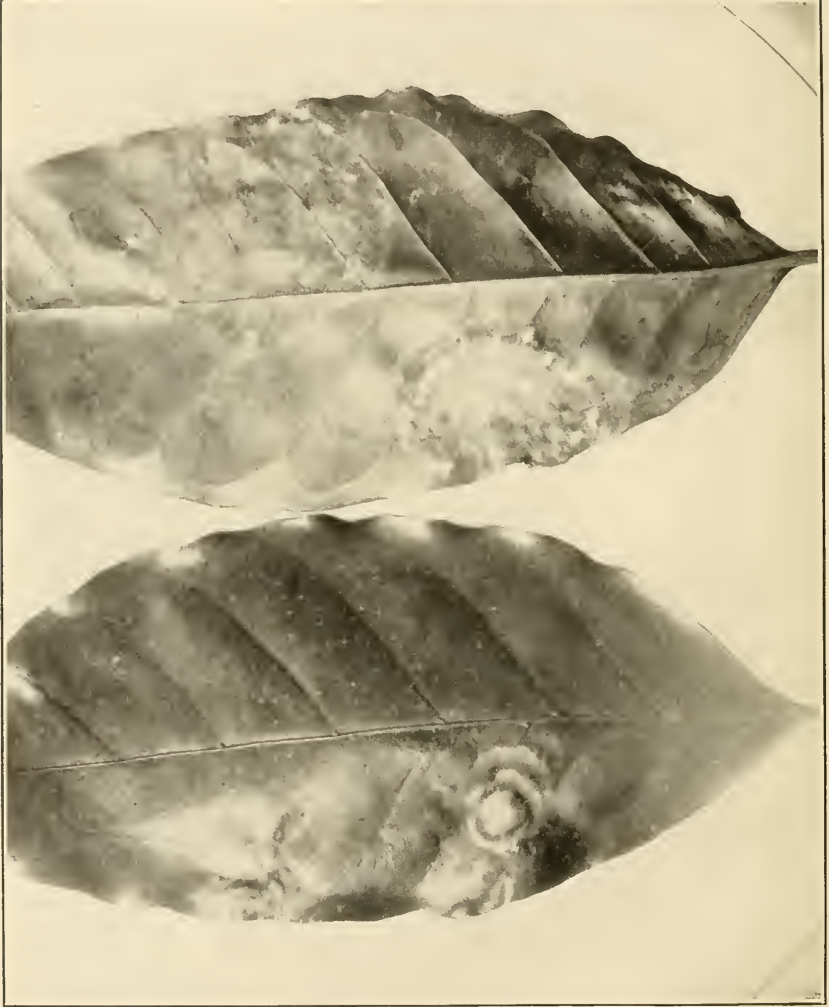
COFFEE LEAVES ATTACKED BY THE ZONAL LEAF SPOT ( CEPHALOSPORIUM SP.), SHOWING UPPER AND LOWER SURFACES.