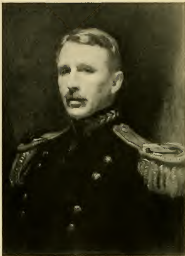
(The Sargent Portrait)