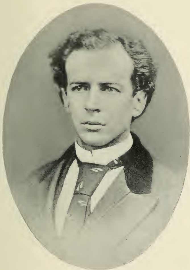
WILFRID LAURIER At twenty-four