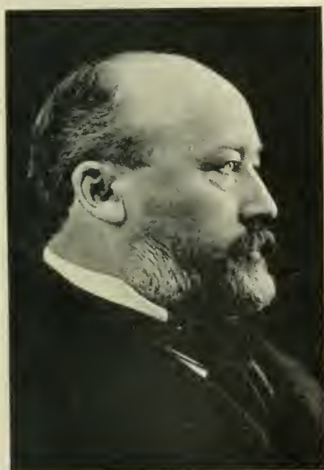
Sir William C. Van Horne General Manager and later President