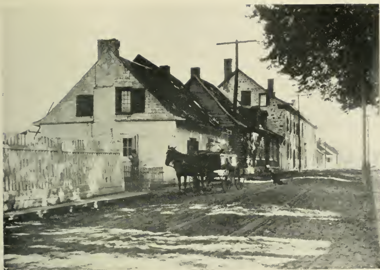
A STREET IN L'ASSOMPTION