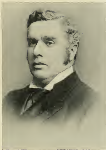
Sir John Thompson, 1892-4