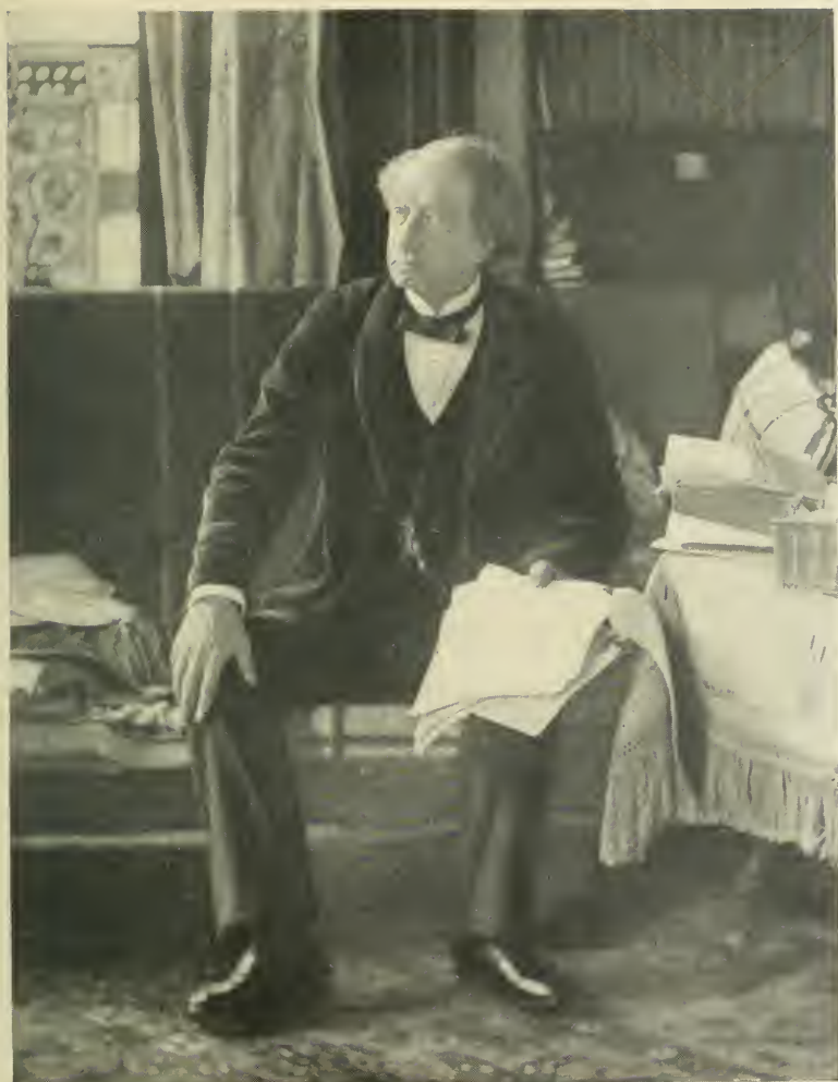
SIR JOHN A. MACDONALD Prime Minister of Canada, 1867-73, 1878-91 (1890)