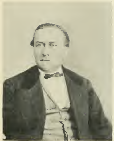
Sir Hector Langevin