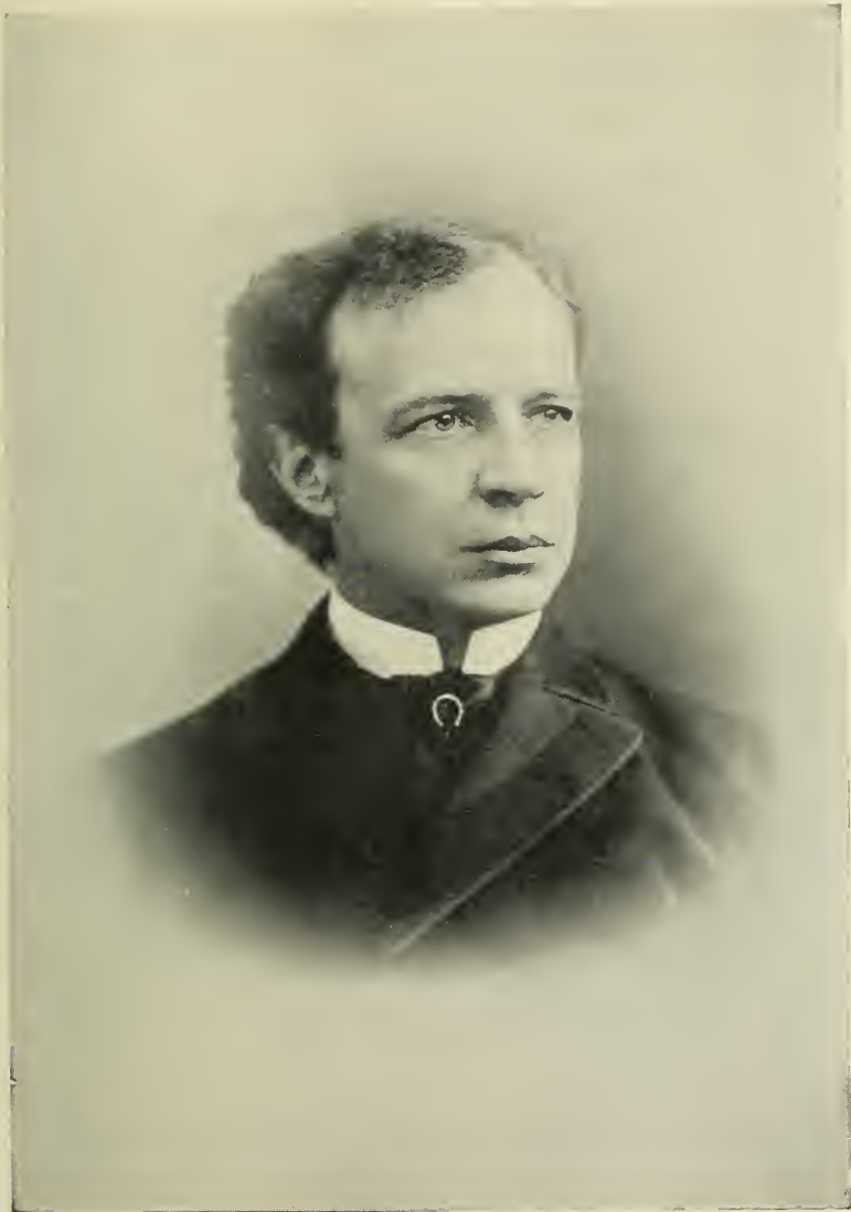
WILFRID LAURIER Leader of the Liberal Party, 1887 (At forty-six)