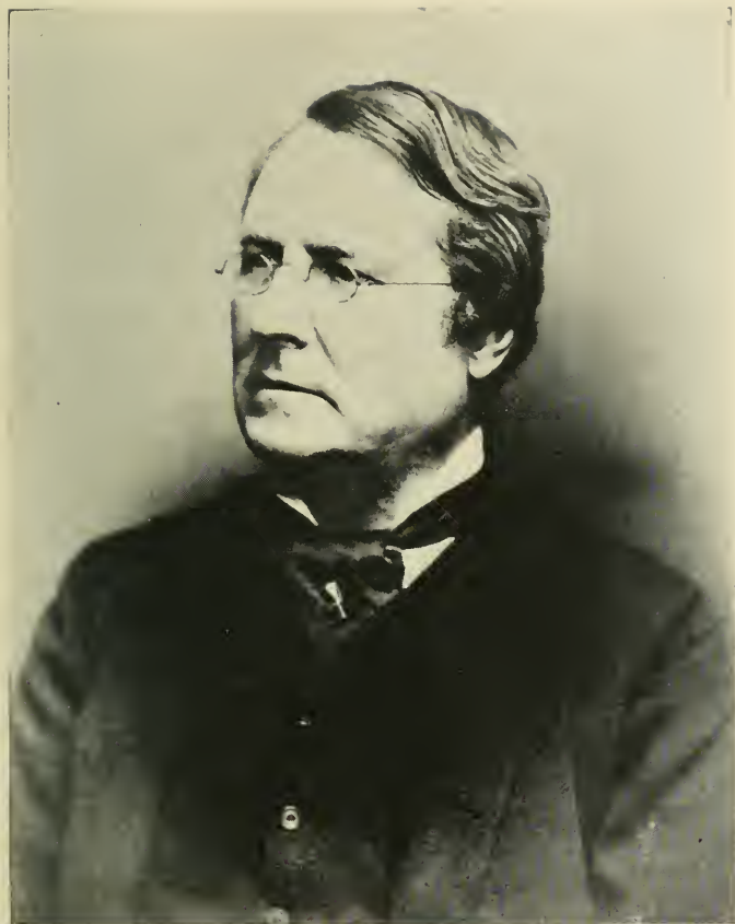
EDWARD BLAKE Leader of the Liberal Party, 1880-87