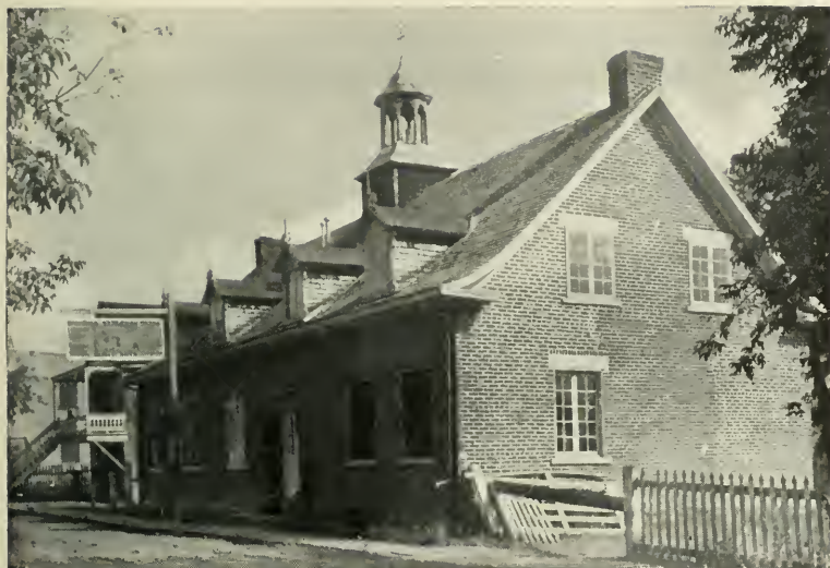
THE VILLAGE SCHOOL, ST. LIN