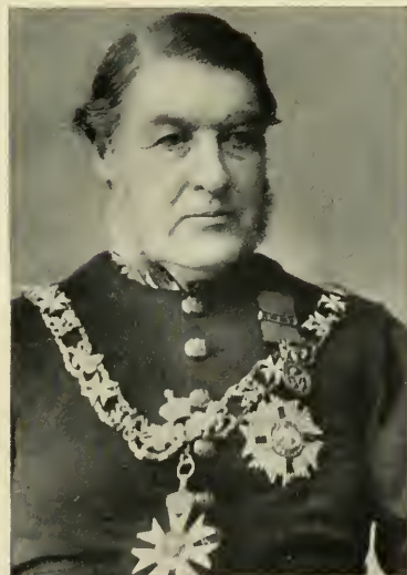
Sir Charles Tupper, 1896