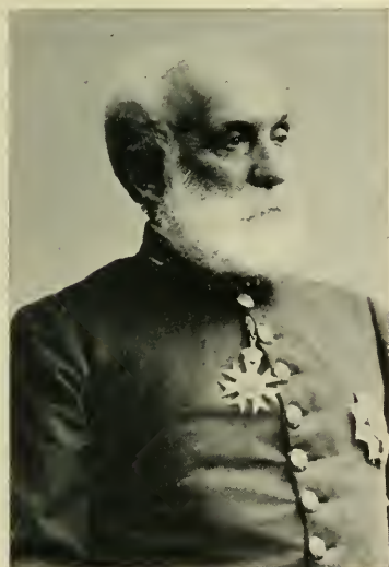
Sir Mackenzie Bowell, 1894-6