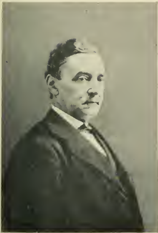
Sir Antoine Aimé Dorion