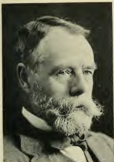
George Stephen Later Lord Mount Stephen First President