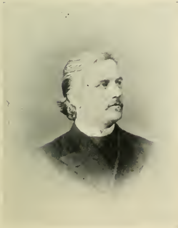
Sir J. A. Chapleau