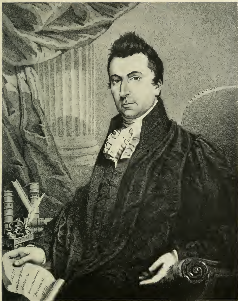
LOUIS JOSEPH PAPINEAU Tribune of Lower Canada (1832)