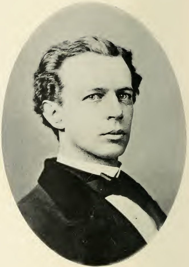
WILFRID LAURIER At twenty-eight