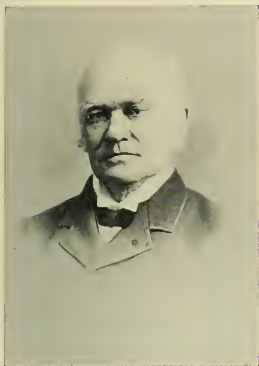
Sir J. J. C. Abbott, 1891-2