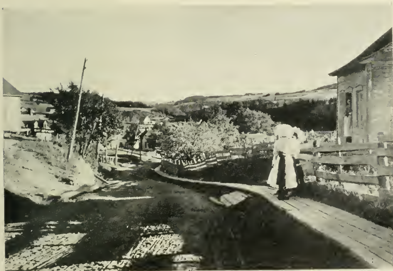
THE HILLS OF ARTHABASKA