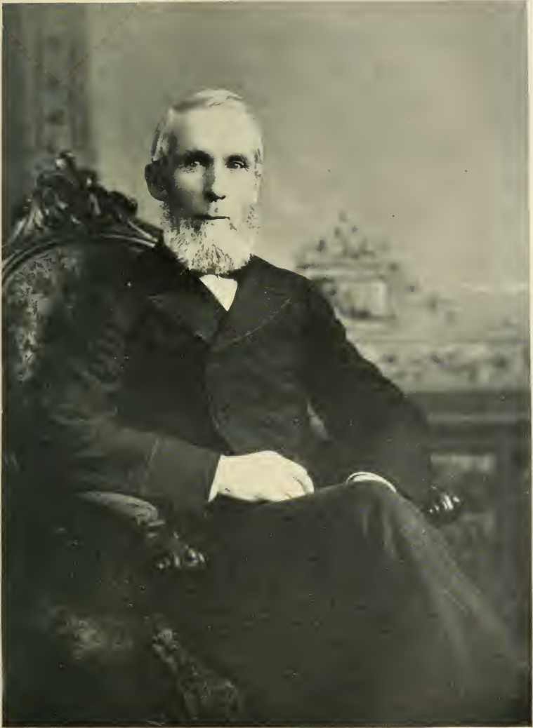
ALEXANDER MACKENZIE Prime Minister of Canada, 1873-1878