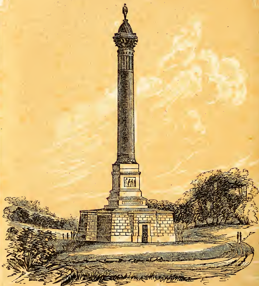
NATIONAL "CLAY" MONUMENT, LEXINGTON, KY.