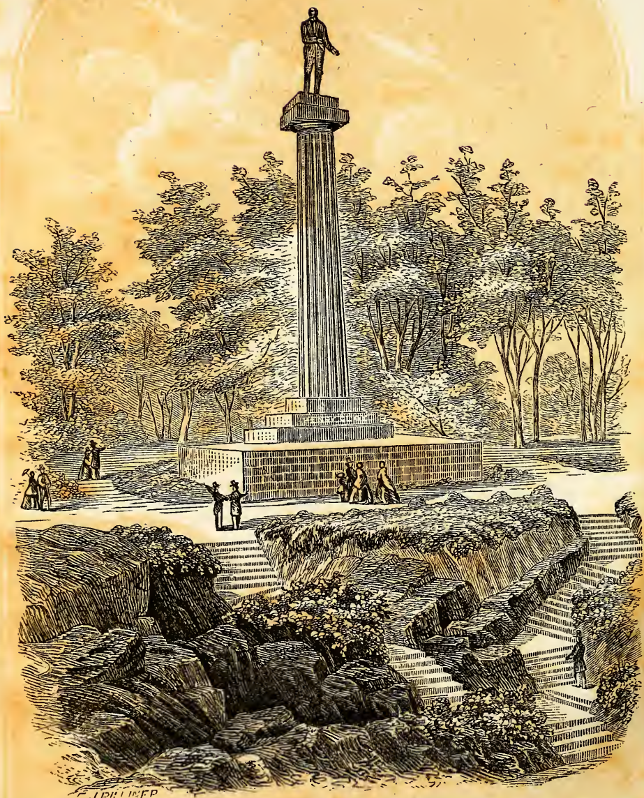
CLAY MONUMENT, POTTSVILLE, PA.