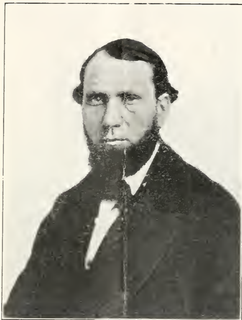
ALLAN PINKERTON, Organizer and First Chief of U. S. Secret Service, War Department. 1860.