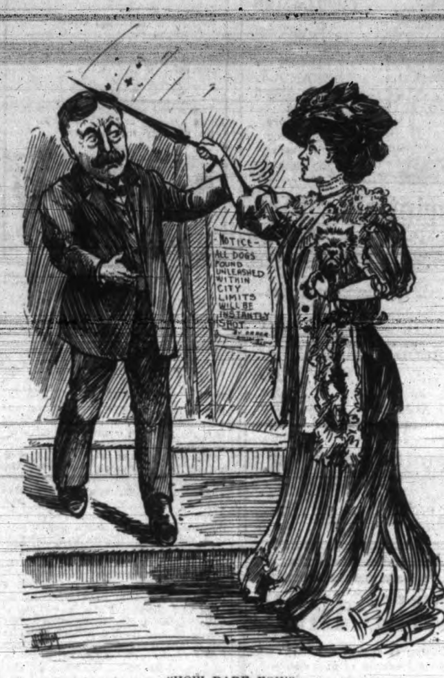
"HOW DARE YOU!"