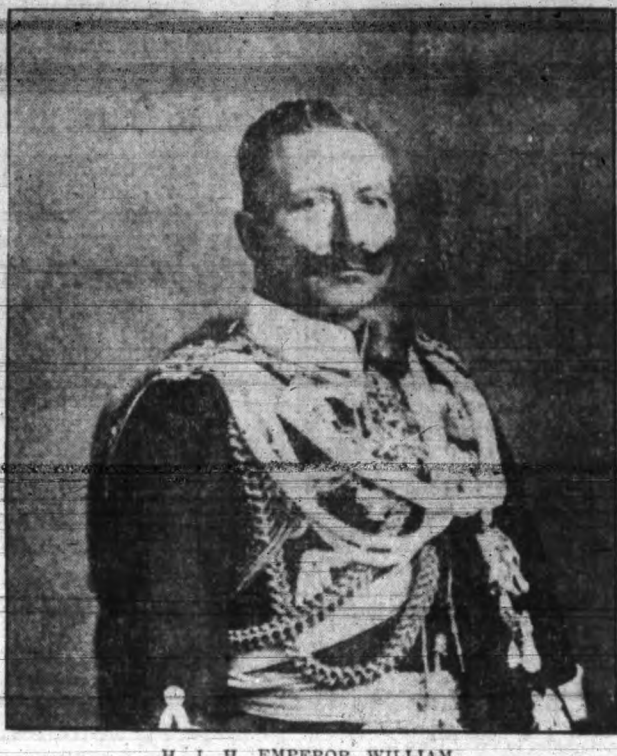
H. I. H. EMPEROR WILLIAM.

London, Nov. 18.—All the London morning papers have editorialized on what some of them call, Von Buelow's triumph, and the Emperor's submission. The Daily Telegraph says: "A very remarkable and striking page of contemporary history has been definitely turned. The Emperor has known how to yield manfully and royally. To yield in such a case shows finer courage than to resist."