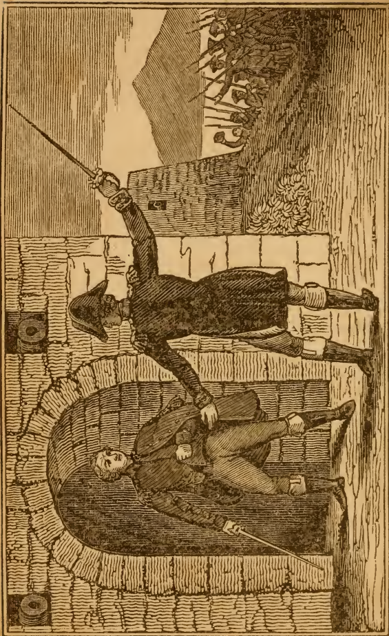
CAPTURE OF TICONDEROGA.