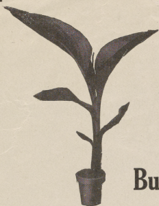
Grow plants like this for your Spring sales