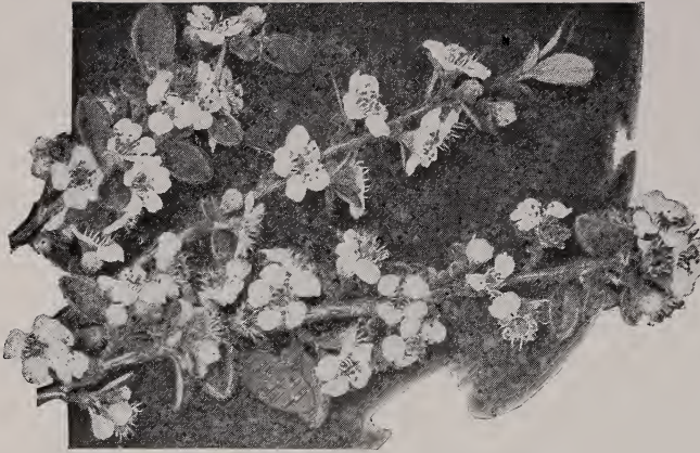
FLOWER BRANCH OF COTONEASTER