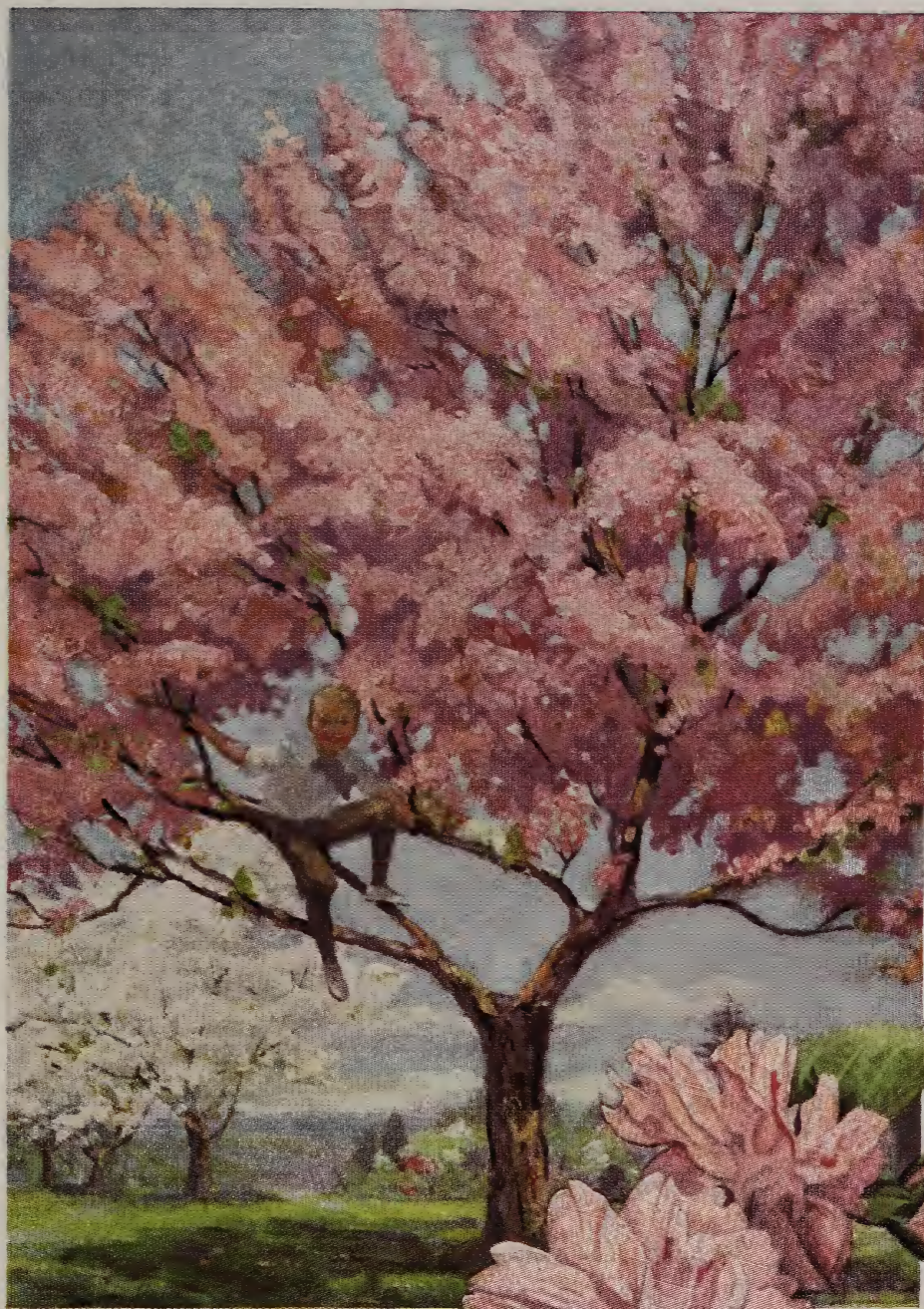
PRUNUS SERRULATA Japanese Double Flowering Cherry