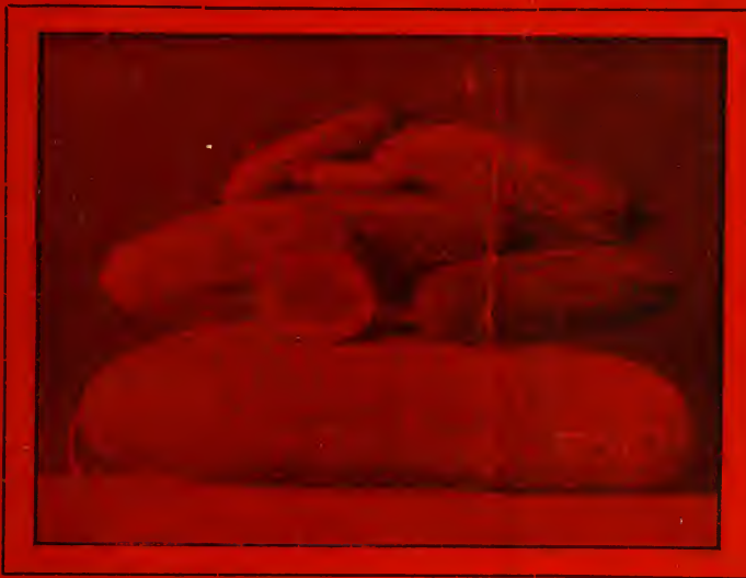
New Cumberland Cucumber.

A splendid new sort first introduced this Spring. See illustration and Description in Seed Annual. Price $1.30 per pound.