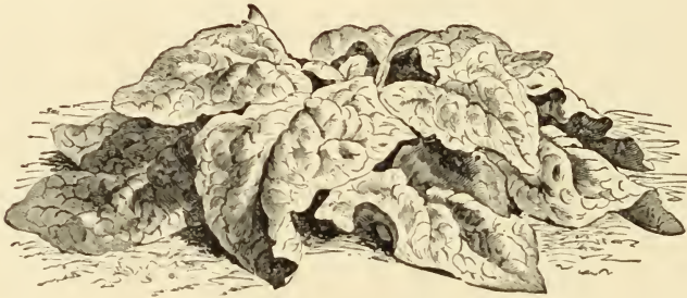
Viroflay Thick Leaf Spinach.