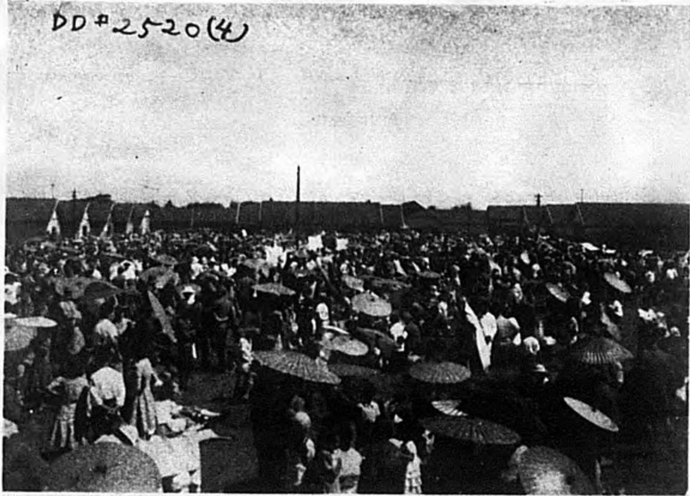
— 俘虜收容所之景象 —