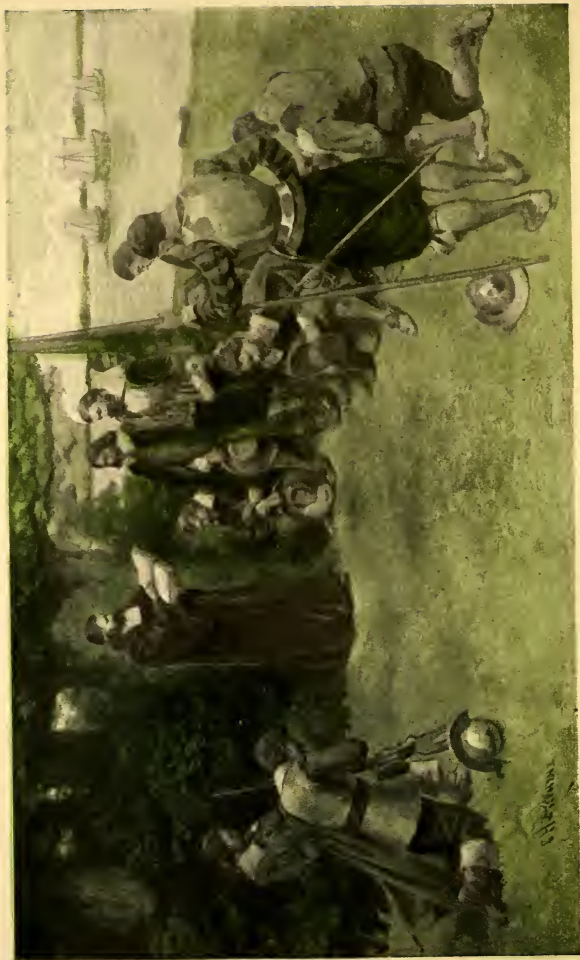
FOUNDING THE FIRST PERMANENT ENGLISH COLONY IN AMERICA AT JAMES TOWNE, VIRGINIA, 1607