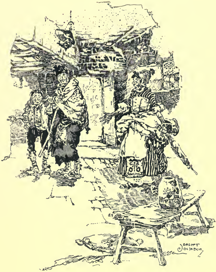
"They returned in the afternoon."