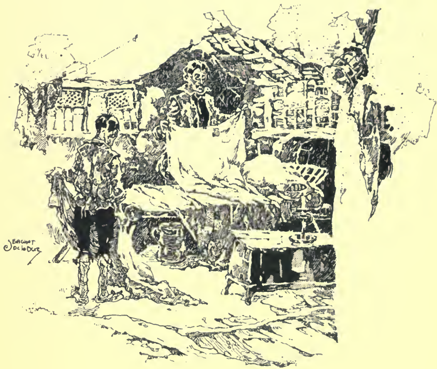
"What there was we spread out."