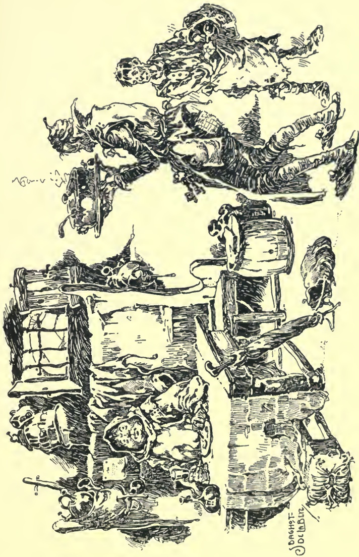
Lazarillo helps at the Inn.