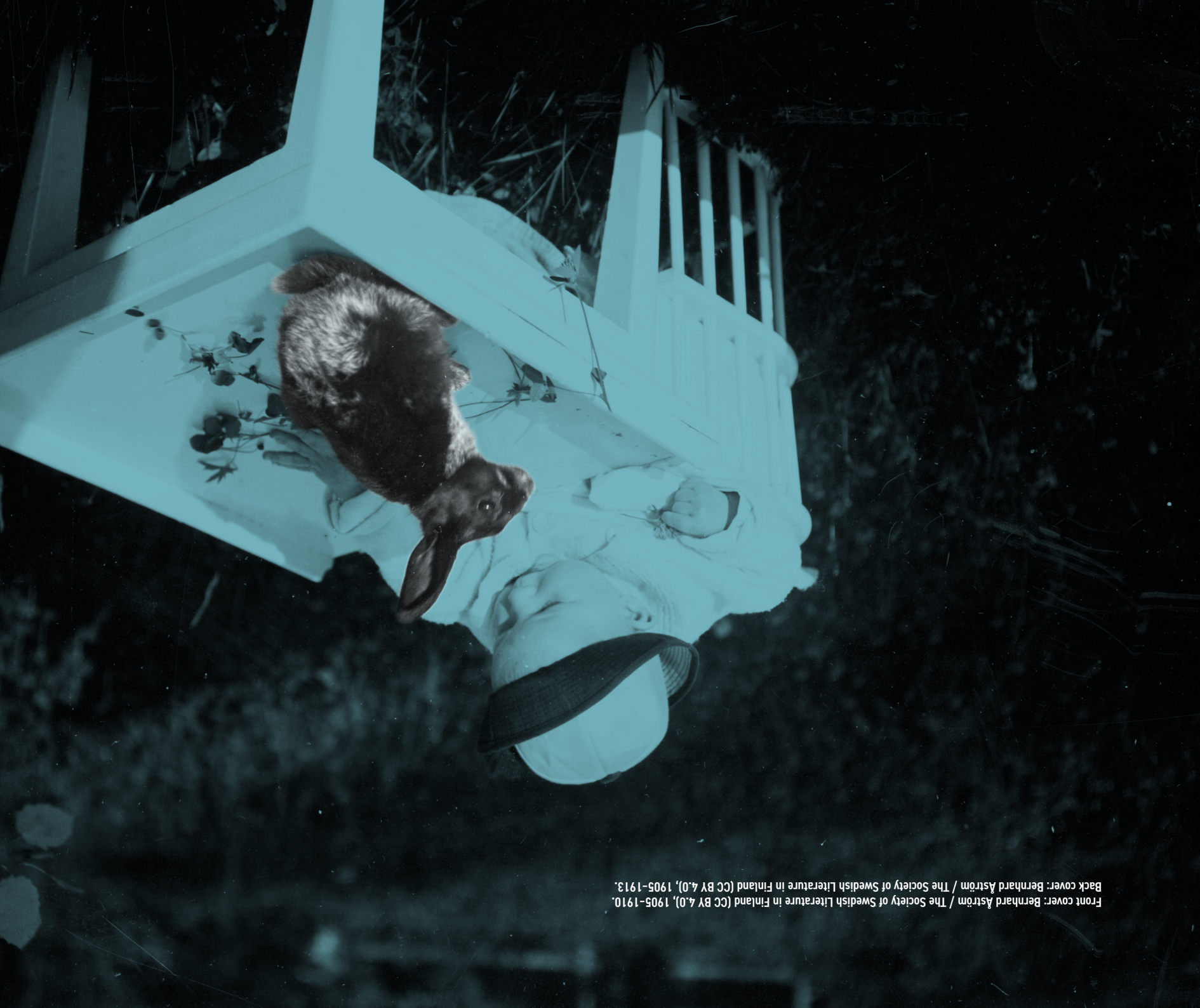
Front cover: 1905-1910. Back cover: 1905-1913.