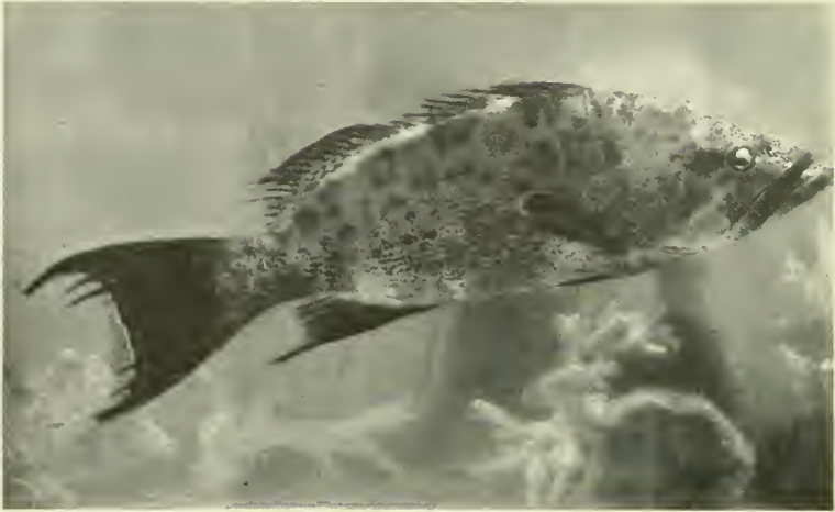
SCAMP ( MYCTEROPERCA FALCATA ).