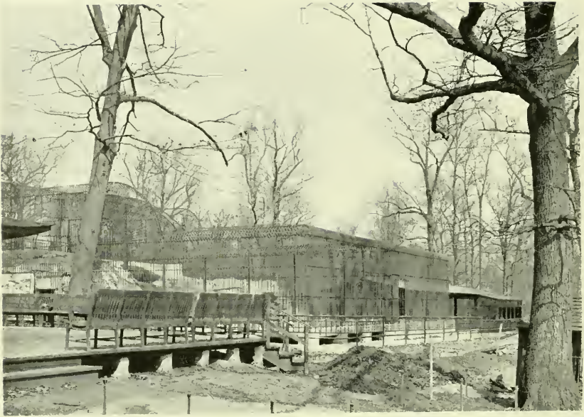
SERIES OF NEW BEAR DENS. Will be completed in 1912.