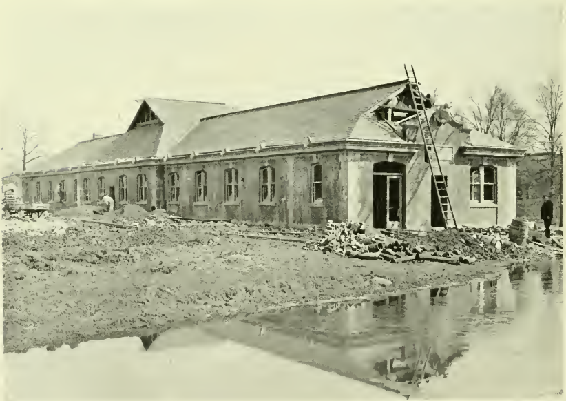
HOUSE FOR WILD EQUINES. Will be completed in 1912.