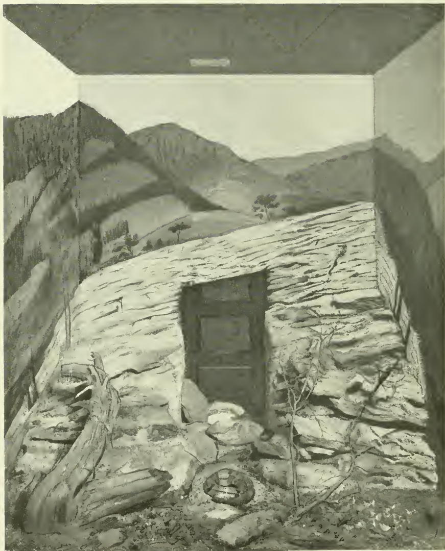
CAGE ARRANGED FOR EXHIBITING RATTLESNAKES. Natural Rock-Work with Painted Background shows a Typical Rattlesnake Den in the Reptile House.