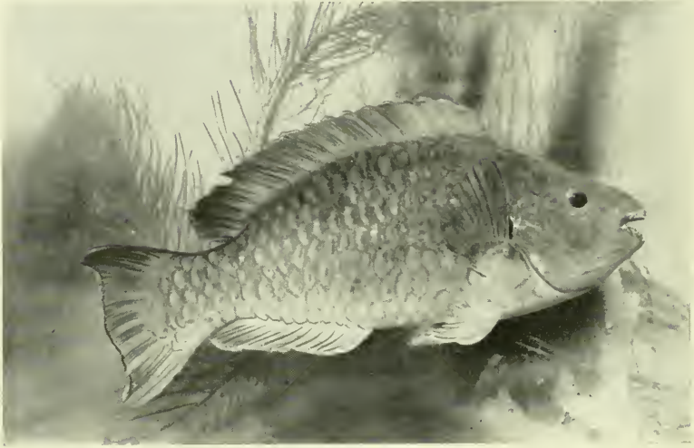
BROWN PARROT-FISH ( PSEUDOSCARUS GUACAMIA ).