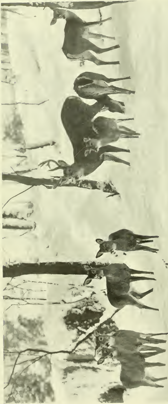
HERD OF WHITE-TAILED DEER, ZOOLOGICAL PARK.