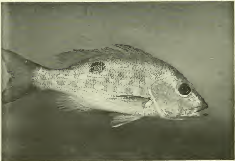
SPOT SNAPPER ( NEOMENIS SYNAGRIS ).