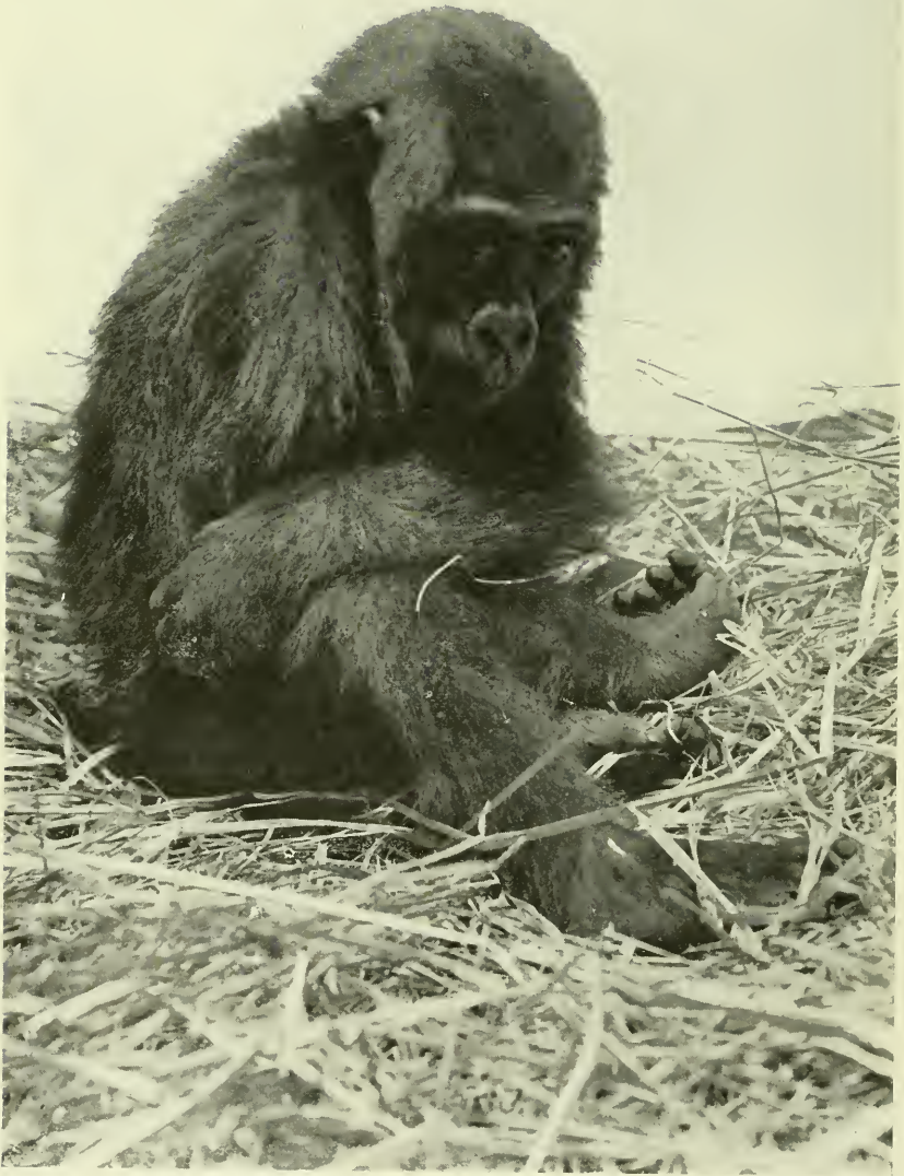
YOUNG FEMALE GORILLA.

Exhibited at the Zoological Park in September and October, 1911.