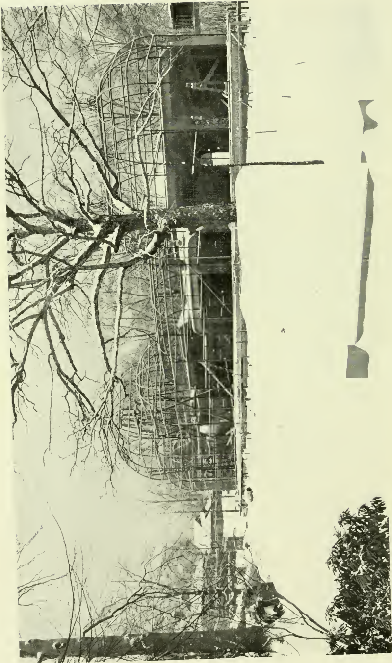
NEW EAGLE AND VULTURE AVIARY. Completed and occupied in 1912.