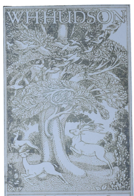
Born, on the South American Pampas Natus Circa 1846,50 Obiit London, 1922