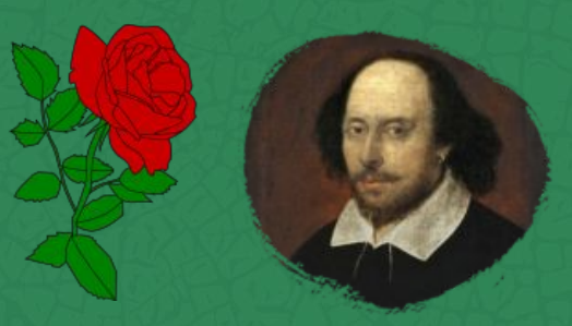
Romeo and Juliet, Act II, Scene II

Let's not discuss the name, let's speak about the concept. If we like the concept we can find a better international name