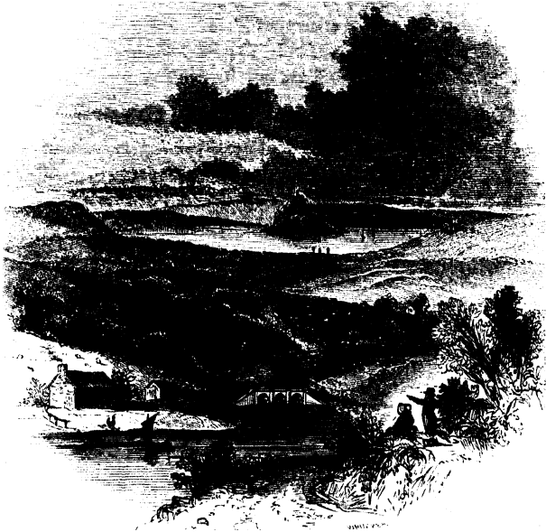
VIEW NEAR MARAZION.