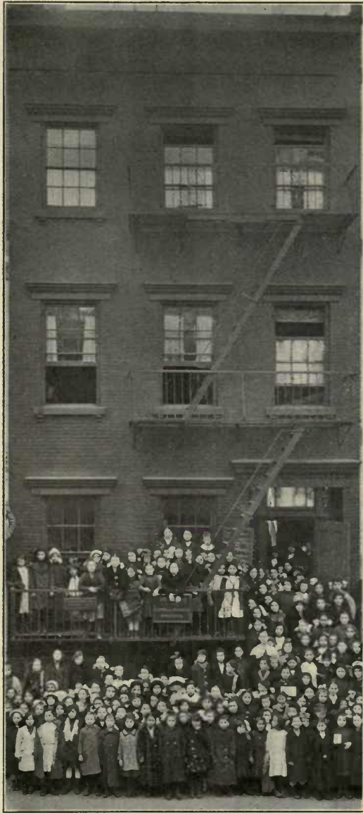
NEIGHBORHOOD HOUSE OF THE SISTERHOOD, 316 EAST 5TH STREET, NEW YORK CITY