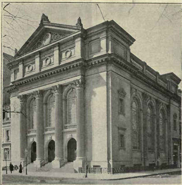
OUR PRESENT SYNAGOGUE Central Park West and Seventieth Street