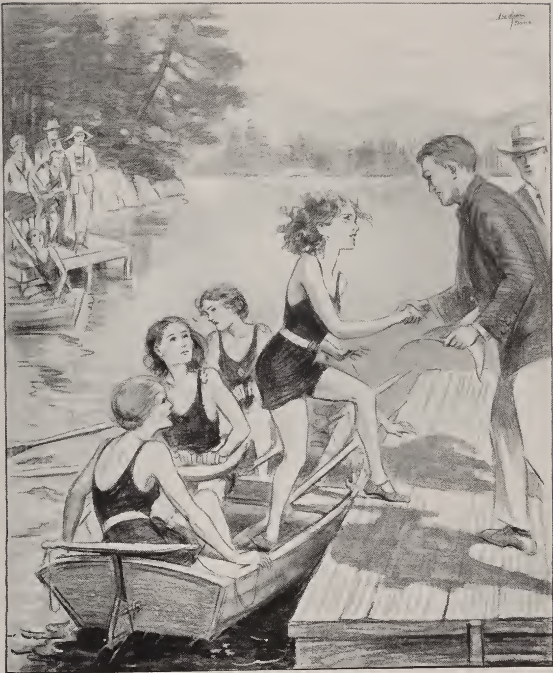
SCATTER SHOOK HANDS CEREMONIOUSLY.--Page 101