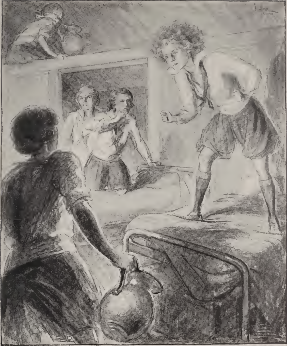
I WAS AFRAID SHE WAS GOING TO FLY AT JAN.--Page 230