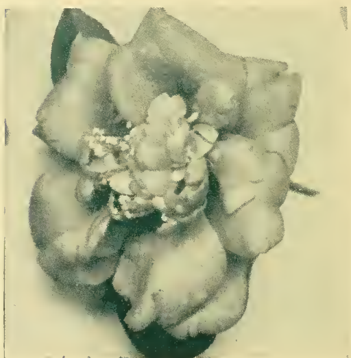
JARVIS RED Semi-Double

ELISABETH —Very double pure white petals are crinkled at end and once in a great while, pure pink flowers of same form will appear. Leaves are very dark, thick green and strong grower. One of best.