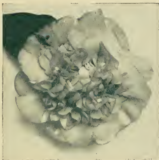
CHANDLERI ELEGANCE Peony Form

CHANDLERI ELEGANCE —One of largest peony flowering Camellias, cherry-red with white variegated. Some are thick peony flowers with 500 petals but some flowers are loose peony form with yellow spemens. See illustration.