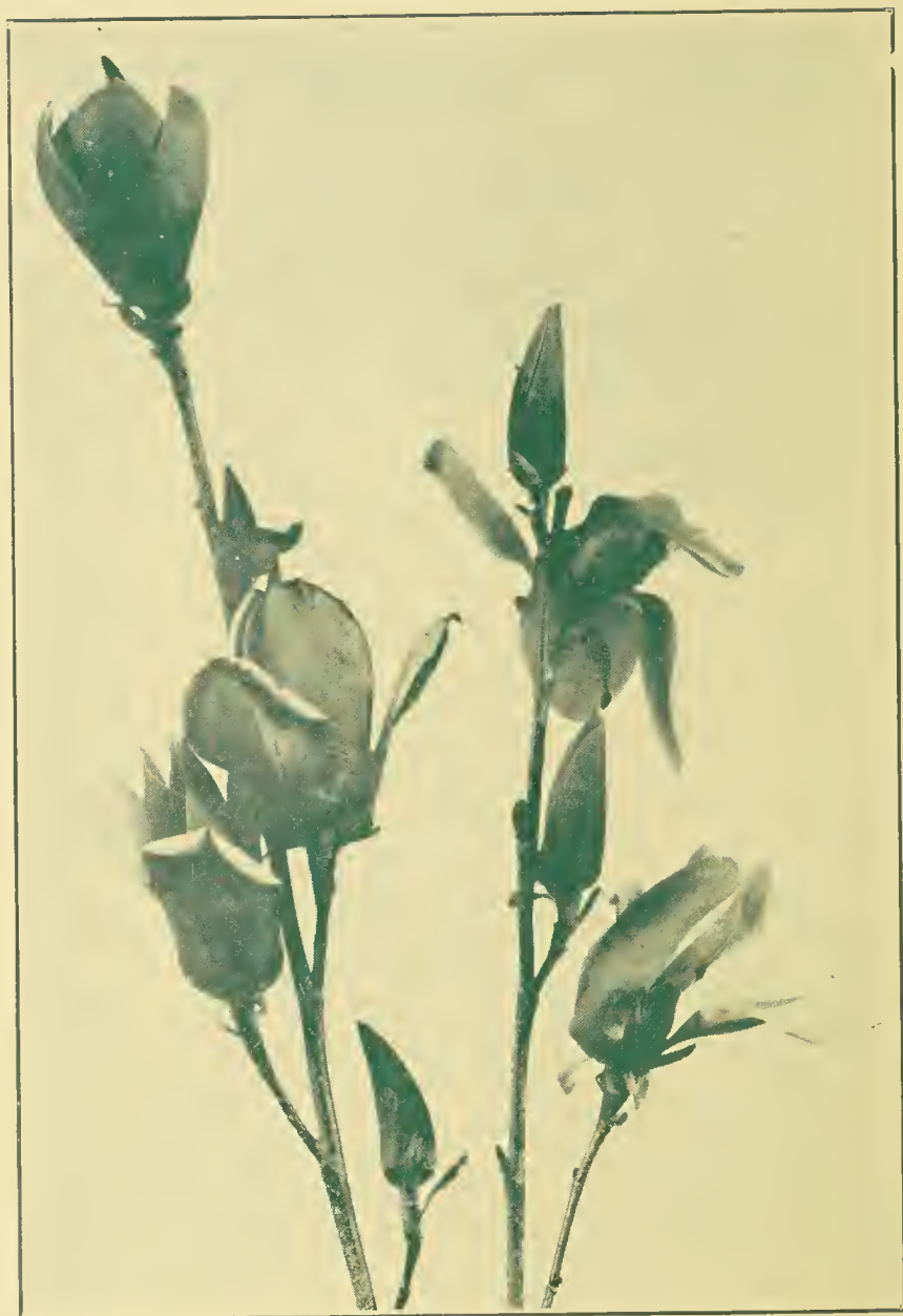
MAGNOLIA LILIFLORA (See Page 18)