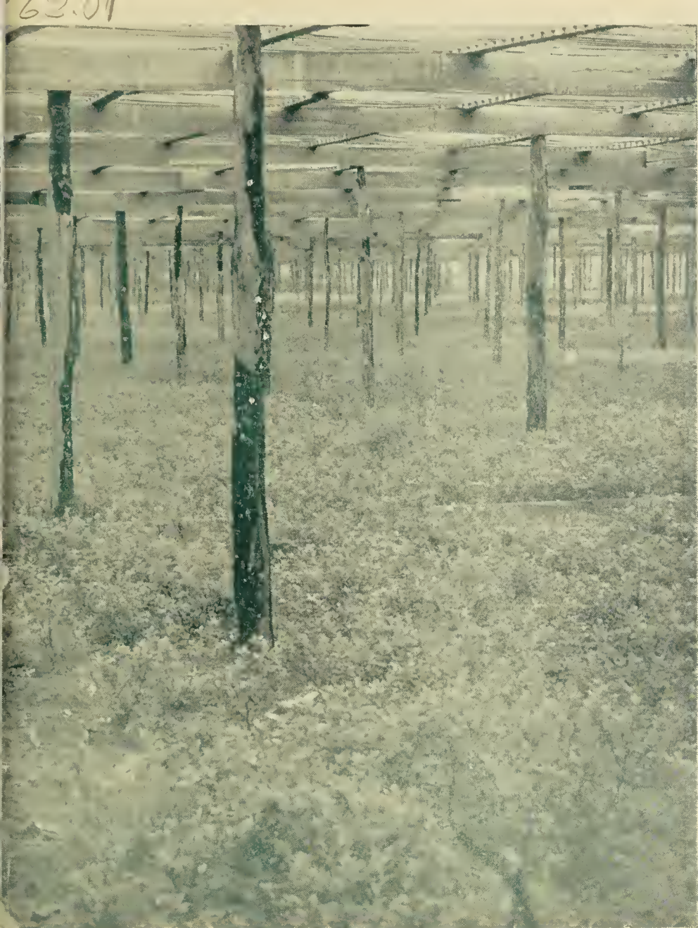
OF ONE OF MY FOUR AZALEA SLAT HOUSES

FEB 10 1936 U. S. Department of Agriculture