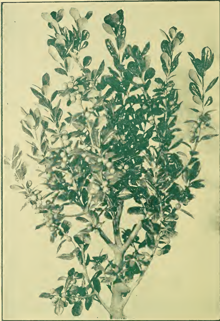
ILEX CORNUTA FEMINA (See Page 23)