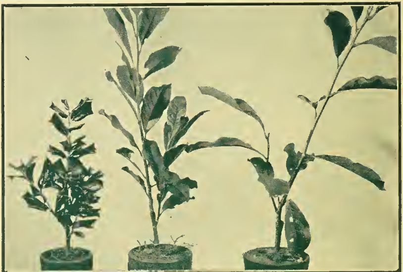
ILEX CORNUTA FEMINA 2½ inch Pot