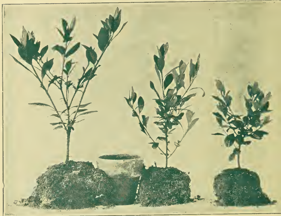
4-6 and 6-8 inch Azaleas shown with 3 inch pot. Our small Azaleas of this Spring offering are better than those illustrated here.

have golden opportunity to give most lasting satisfaction to their customers and incidentally enrich themselves by planting extensive collection of this showy plant in their nurseries, because azaleas will sell themselves when your customers see them in full bloom. We are listing most of important varieties, eliminating weaker growers or inferior flowers when same color can be had in better varieties.