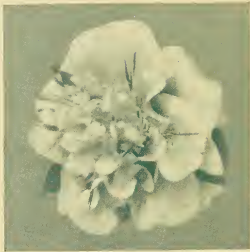
HERME Loose Peony

LADY HUME'S BLUSH —Very double and symmetrical petals are delicately blushed with flesh color which is much lighter than Pink Perfection.