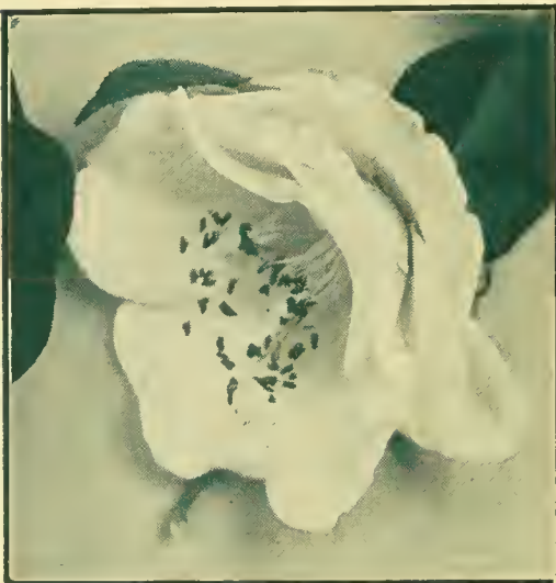
SEMI-DOUBLE BLUSH Light Semi- Double

MONARCH —Deep pink flower of enormous size, having many clusters of stamen and petals, inside of larger outer petals, making a single flower equal to a bouquet. Beautiful foliage and compact grower.