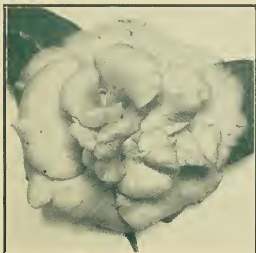
GLOIRE de NANTES Center Petals Twisted

This class includes some of very good kinds, often as good as our A Class but because of a little more plentiful supply, we are listing these excellent varieties at much lower prices.